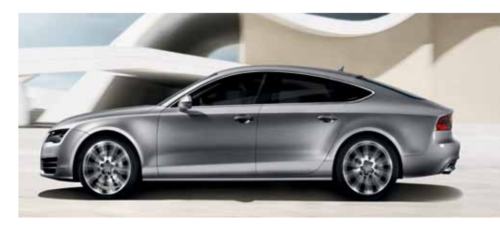
* 18 city/28 highway mpg. EPA estimates. Your mileage will vary.

The beauty of FSI and TFSI technologies is that they work at any RPM, maximizing efficiency and generating responsive and optimal power during all driving conditions.