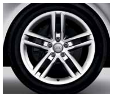
19" five-double-spoke wheels with 255/40 summer performance tires* | The dynamic look of the 19" wheels is complemented by the summer performance* tires that offer enhanced handling. [Optional with A7 Sport Package only]

18" seven-spoke wheels with 255/45 all-season tires | The luxurious appearance of these 18" wheels with all-season tires offers a refined complement to the style of the A7. [Premium]