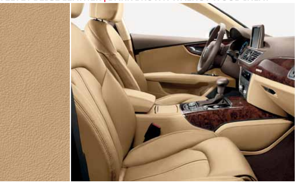
VELVET BEIGE LEATHER DARK BROWN WALNUT WOOD INLAY*