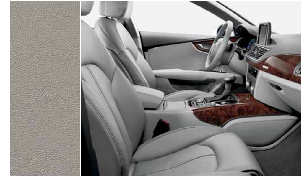
TITANIUM GRAY LEATHER DARK BROWN WALNUT WOOD INLAY**