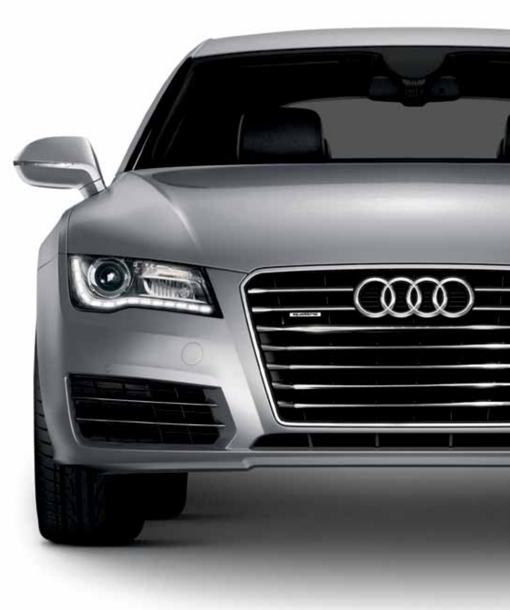
European vehicle and specifications shown with optional equipment.