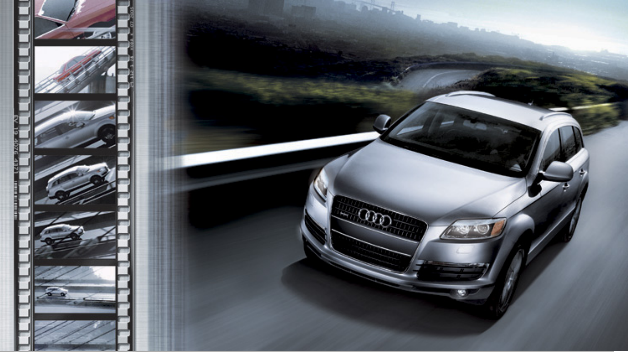
2007 > Audi Q7 > For more than 25 years, we've built quattro® for our cars. Now we've built a vehicle for quattro.