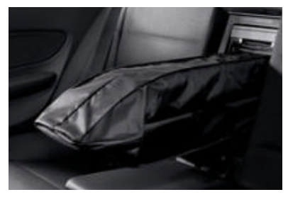
Ski bag allows clean and secure transport of four pairs of skis and ski poles as well as other long items. When the ski bag is not extended, it can be stored out of sight to save space, and the fold-down center armrest can be left down for use.