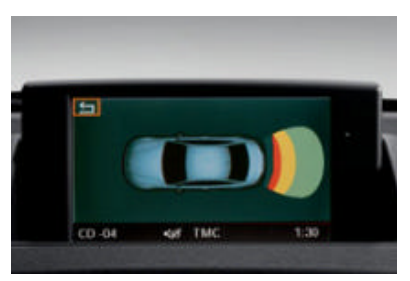
□ Park Distance Control uses ultrasonic sensors in the rear bumper to help you judge the distance to other cars and unseen objects when parking. The beeping becomes faster as your bumper approaches the object, turning into a constant tone when the distance is less than 12 inches.