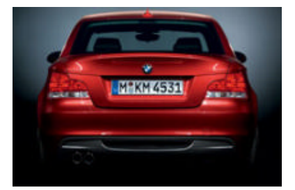
■ Rear spoiler adds to the excellent driving dynamics by keeping the rear of the car stable at higher speeds.

<sup>2</sup> Run-flat tires do not come equipped with spare tire and wheel. <sup>3</sup> Performance tires are not recommended for driving in snow and ice. Due to low-profile tires, please note: wheels, tires and suspension parts are more susceptible to road hazard and consequential damages.