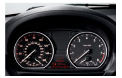
Dashboard features easy-to-read numbers with special scales that include additional display ranges in the instrumentation.