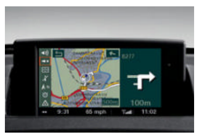
□ Navigation system covers the U.S. with a single DVD. The glare-free monitor is mounted neatly into the dashboard for easy viewing. Using GPS satellites and DVD technology, a map of your area appears on the dash monitor, showing – and telling – the directions to your desired destination. It also provides Real Time Traffic Information on potential traffic problems and solutions.