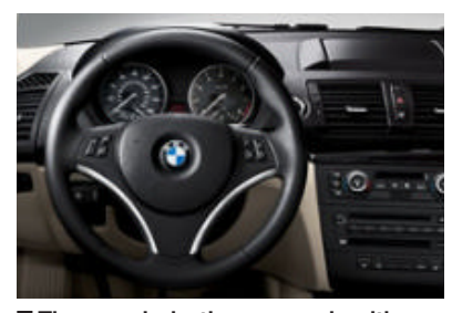
■ Three-spoke leather-wrapped multifunction steering wheel lets you keep both hands on the wheel while adjusting various comfort functions, such as controls for audio system, cruise control and hands-free phone controls.