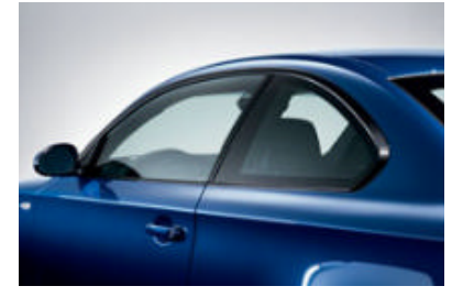
Shadowline trim gives a sporty look to front and rear side-window frames, window recess finishers, and door-sill trim strips.

<sup>5</sup> M sport steering wheel included in 135i Sport Package only. When equipped with optional STEPTRONIC automatic transmission and optional Sport Package, also comes with steering wheelmounted paddle shifters.