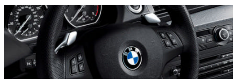
□ Steering wheel-mounted paddle shifters allow you to shift gears manually without a clutch. This optional feature comes included in the 1 Series Coupe when it is equipped with optional STEPTRONIC automatic transmission and Sport Package.