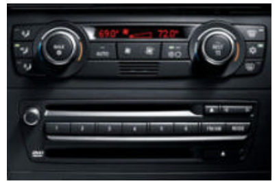
■ Automatic climate control system allows occupants to select a specific cabin temperature and choice of fan speeds, as well as automatic or manual airflow and recirculation. The automatic recirculation control activates whenever certain air pollutants are detected. The system also includes defrost/demist and MAX A/C functions.

For more information on HD Radio receivers and to find HD Radio AM/FM stations near you, visit HDRadio.com.