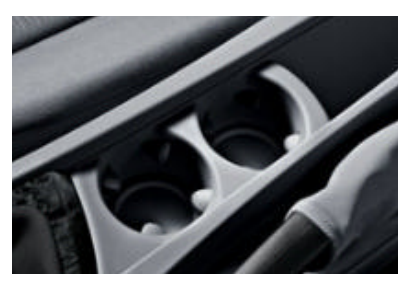
■ Cupholders integrated into the center console are located within convenient reach of the driver and front passenger (as shown). Cars with optional Navigation system are fitted with one cupholder in the center console, and one attached in the passenger footwell.