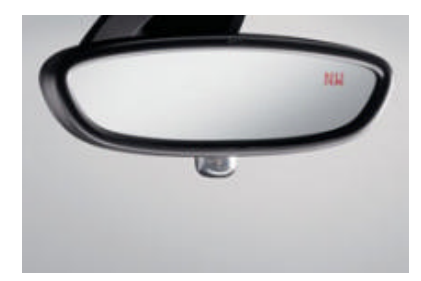
The automatic-dimming inside rear-view mirror darkens in response to the bright headlights of vehicles behind you. The easy-to-read digital compass, integrated into the mirror, is a convenient way to constantly keep your bearings while driving.