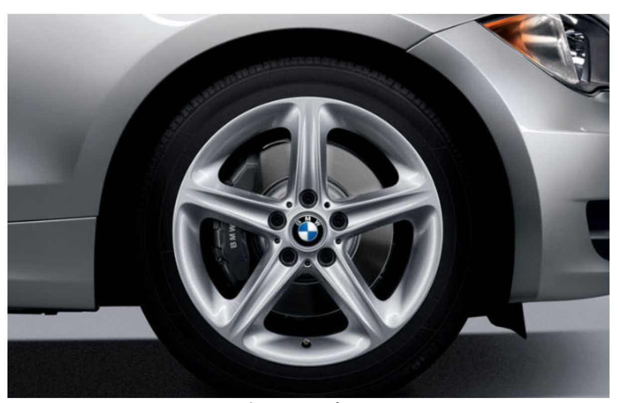
■ Star Spoke (Style 264) light alloy wheels and run-flat<sup>1</sup> performance tires.<sup>2</sup> In front: 18 x 7.5 wheels and 215/40 tires; in back: 18 x 8.5 wheels and 245/35 tires.<sup>3</sup> (std. on 135i)

<sup>1</sup> Run-flat tires do not come equipped with spare tire and wheel.