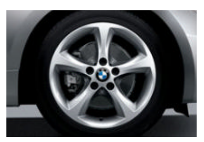
■ 17 x 7.0 Star Spoke (Style 256) light alloy wheels with 205/50 run-flat<sup>1</sup> all-season tires. (std. on 128i)