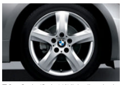
□ Star Spoke (Style 142) light alloy wheels with run-flat<sup>1</sup> all-season tires. In front: 17 \times 7.0 wheels and 205/50 tires; in back: 17 \times 7.5 wheels and 225/45 tires.<sup>3</sup> (No-cost opt. on 135i)