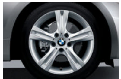
□ Star Spoke (Style 262) light alloy wheels and run-flat<sup>1</sup> performance tires.<sup>2</sup> In front: 17 \times 7.0 wheels and 205/50 tires; in back: 17 \times 7.5 wheels and 225/45 tires.<sup>3</sup> (included in 128i Sport Package)