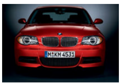
Front apron sits below the BMW double kidney-shaped grille with chrome slats. This feature, which brings a constant flow of fresh air to the engine, adds to the front's impressive athletic profile. The central air intake is flanked by two side air intakes that cool the brakes. Two side flaps accentuate the broad front.