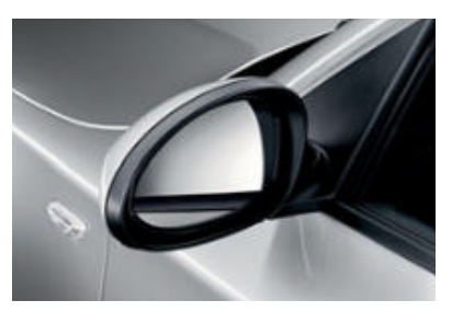
Power-folding exterior side-view mirrors automatically dim when reflecting bright lights, helping to eliminate glare when driving at night.

Ambiance light package includes lights in the exterior door handles that radiate downward whenever the doors are unlocked. They illuminate the area outside the doors for approximately 20 seconds to enable safe vehicle access in the dark. Also included are front and rear reading lights, front footwell illumination, vanity mirror lights for driver and front passenger, and ambiance interior lighting.