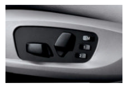
□ Power seat adjustments included with 8-way power front seats allow customized comfort and convenience for driver and front passenger. The two-setting memory system automatically adjusts the driver's seat and side-view mirror positions, with individual preferences available at your fingertips.