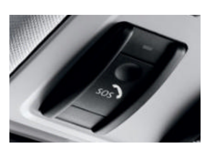
□ BMW Assist<sup>™</sup> and Bluetooth<sup>®</sup> system offers hands-free calling through your BMWapproved Bluetooth phone. BMW Assist Safety Plan includes Automatic Collision Notification, Enhanced Roadside Assistance, Remote Door Unlock and more. Also available is an optional Convenience Plan with Directions and Weather information, and Concierge service.