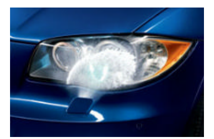
I / □ High-intensity headlight washers help keep lights clean of ice, mud, road salt and other coatings, for maximum road lighting and enhanced driving safety. (Retractable washers std. on 135i; fixed washers included in 128i Cold Weather Package. 135i shown)

■ / □ Xenon Adaptive Headlights provide brilliant clarity of the road ahead and to the side at night and in conditions with poor visibility. The dynamic auto-leveling feature adjusts for varying passenger and cargo loads, helping to keep headlight glare out of the eyes of oncoming drivers. BMW Adaptive Headlights provide optimum road illumination around corners, thanks to an electromechanical control system that directs the headlights into and around the bend as soon as the vehicle begins cornering. The Corona headlight-rings that circle both headlights and high beams also act separately as Daytime Running Lights and parking lights. (std. on 135i; opt. on 128i)