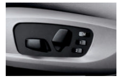
Power seat adjustments included with 8-way power front seats allow customized comfort and convenience for driver and front passenger. The two-setting memory system automatically adjusts the driver's seat and side-view mirror positions so individual preferences are always available at the touch of a button.