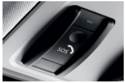
BMW Assist and Bluetooth system offers hands-free calling through your BMWapproved Bluetooth phone. Safety Plan includes Automatic Collision Notification, Enhanced Roadside Assistance, Stolen Vehicle Recovery and more. Optional Convenience Plan offers Directions, Traffic and Weather information, Critical Calling and Concierge Service (requires Safety Plan).