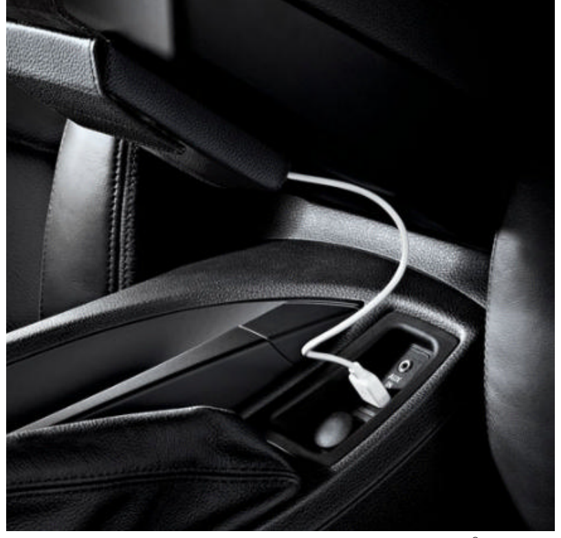
■ Auxiliary input port lets you connect an external audio source, such as an iPod<sup>®</sup> or MP3 player.

□ iPod and USB adaptor lets you scroll through and select the music you want by using the vehicle's radio controls or the multi-function steering wheel buttons. Music titles are displayed on the radio or Navigation screen.