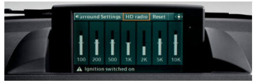
□ HD Radio<sup>™</sup> receives free, digital AM/FM broadcasts across the U.S. in clear, static-free quality sound – AM sounds like FM; FM sounds like CD. Also enjoy new "multicast" FM stations, as well as a variety of innovative data services. Can be ordered with optional Premium Hi-Fi audio system.

For more information on HD Radio receivers and to find HD Radio AM/FM stations near you, visit HDRadio.com.