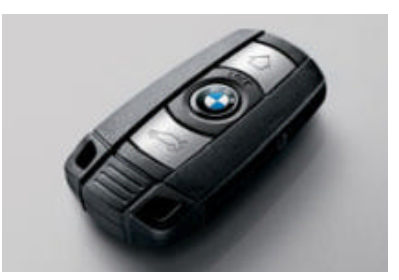
□ Comfort Access system offers convenient keyless access to your car. Simply carrying the remote key in a pocket or purse allows you to unlock the doors by touching the door handle. You can also turn the engine on or off by pressing the Start/Stop button<sup>1</sup> without inserting the remote key.

<sup>1</sup>Foot must be on the brake; with manual transmission, clutch must also be depressed in order to start.