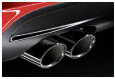
■ Black chrome-plated double tailpipe is standard on the 135i Coupe's exhaust system.

■ High-performance disc brakes, with inner ventilation and "BMW" painted on the calipers (6-piston calipers in front/2-piston calipers in the rear) measure 13.3" front/12.8" rear. Designed for high-performance driving, their large diameters help provide shorter braking distances and superior stopping ability.