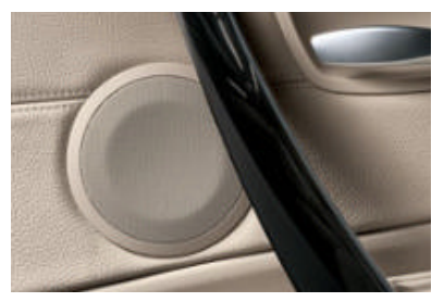
□ Premium Hi-Fi anti-theft AM/FM stereo CD/MP3 sound system with upgraded speakers (including two subwoofers), Radio Data System (RDS), Auto-Store and threechannel FM diversity antenna. Displays MP3 song title and artist. The Digital Sound Processor (DSP) can make the interior sound like a jazz club, concert hall or cathedral.