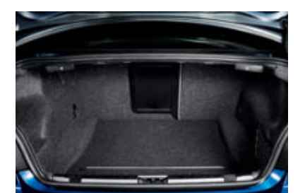
■ Lined luggage compartment is illuminated and can be expanded by folding down the split-folding rear seats. An elastic strap on the left-hand side, a flexible storage net on the right and lashing points on the inside edge help to ensure safe transportation of cargo. (Shown with optional Cold Weather Package pass-through opening for ski bag.)