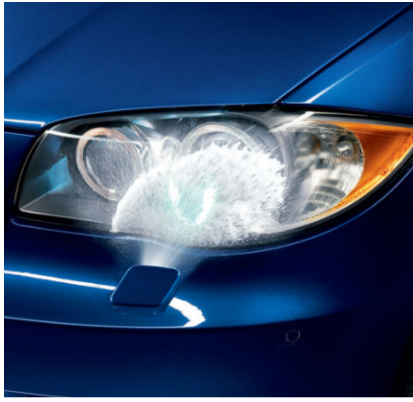
High-intensity headlight washers help keep lights clean of ice, mud, road salt and other coatings, for maximum road lighting and enhanced driving visibility. (Retractable headlight washers std. in 135i; headlight washers in the 128i Cold Weather Package are not retractable.)

<sup>1</sup> Retractable headlight washers standard in 135i.