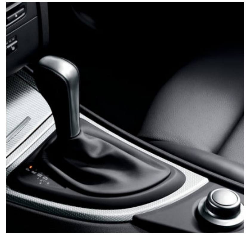
□ 6-speed STEPTRONIC automatic transmission provides a choice of three modes: "Drive," which incorporates BMW's Adaptive Transmission Control; "Sport" automatic, for a more dynamic shift pattern; and STEPTRONIC automatic, for the hands-on control of a manual without using a clutch.