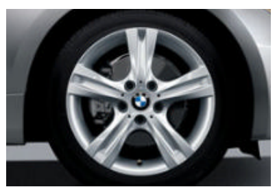
Star Spoke (Style 262) light alloy wheels and run-flat<sup>2</sup> performance tires.<sup>3</sup> In front: 17 x 7.0 wheels and 205/50 tires; in back: 17 x 7.5 wheels and 225/45 tires.<sup>3</sup> (included in 128i Sport Package)