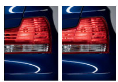
■ Adaptive Brake Lights increase vehicle visibility and signal the intensity of your braking action. In the event of an emergency stop, the illuminated area of the brake lights is increased, so traffic following behind you knows to stop quickly.