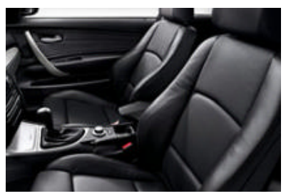
□ Eight-way adjustable front sport seats, included in the Sport Package, make the driving experience more enjoyable. Side bolsters can be power-adjusted to fit your back comfortably while helping to hold you firmly in place during tight cornering. Includes two-way headrests and thigh support for added support. (Shown with optional Black Boston Leather upholstery and iDrive.)