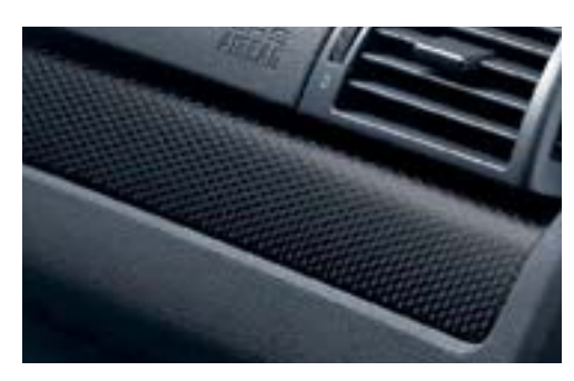
Aluminum Black Cube interior trim: The black aluminum cube interior trim makes for a more sporty, high-tech interior. Silver Cube interior trim, a no-cost option, is also available.