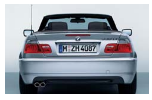
The rear apron , with its integrated diffuser, upgrades the car's aerodynamics.