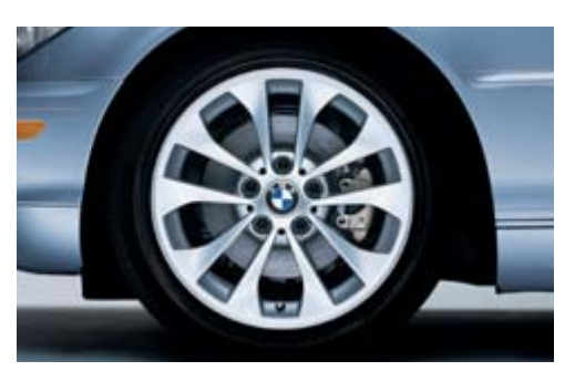
■ The 330Ci with 17 x 7.0 Double Spoke (Styling 98) alloy wheels, and 205/50R-17 all-season tires.