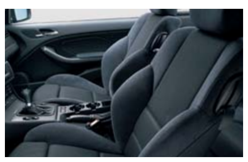
Sport seats upholstered in Alcantara/cloth, a nocost option, provide optimum lateral support while adding a dynamic, custom touch. Montana leather is also available for those who prefer the look and feel of all-leather upholstery.