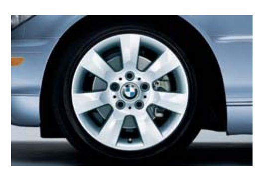
■ The 325Ci with 16 x 7.0 Star Spoke (Styling 169) alloy wheels, and 205/55R-16 all-season tires.