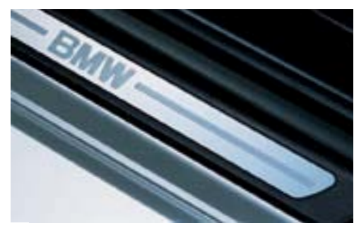
■ Chrome rocker panel strips help protect paint from scuffs and chips.