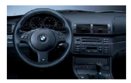
M three-spoke leather-wrapped multi-function sport steering wheel has fingertip cruise, audio and telephone<sup>1</sup> controls.