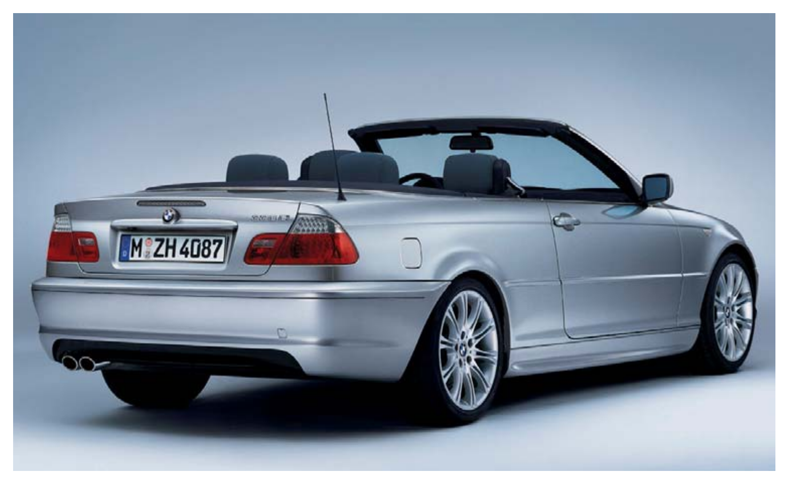
Clean lines, throaty sound. The exhaust has been specially tuned to emit a distinctly more assertive sound than the standard 3 Series Convertible. This lusty growl is conducted through two handsome 35mm exhaust tips, which are set into a sleek, rear apron.