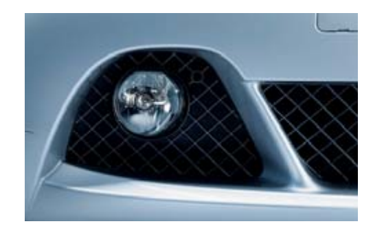
■ Halogen free-form foglights are cleanly integrated into the front bumper, illuminating the road ahead in bad weather.