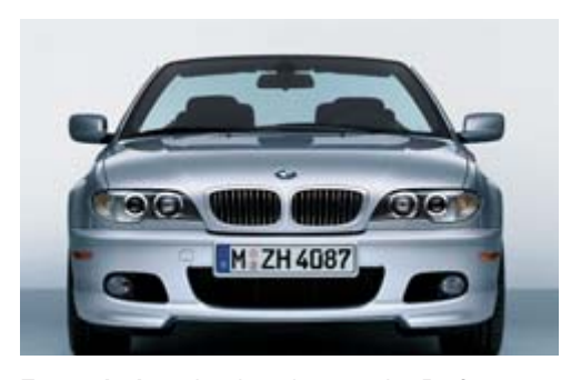
Front air dam that is unique to the Performance Package displays a face that's all business.

The 330Ci Performance Package is a product of BMW Individual – the division responsible for creating unique, limited-edition BMWs. It includes a more muscular engine that boasts 235 hp at 5900 rpm, and 222 lb-ft of torque at just 3500 rpm. To make the most of this extra power, the redline has been increased from 6500 to 6800 rpm. Additional, distinctive exterior and interior features further differentiate the Performance Package from all other 3 Series models.