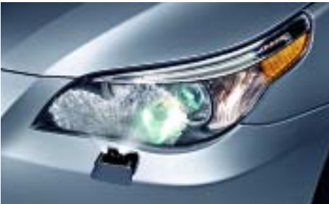
□ High-pressure liquid headlight cleaning system helps keep headlights clean of ice, mud, road salt and other coatings, for maximum road illumination and enhanced driving safety. (included in Cold Weather Package)