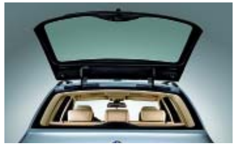
■ / □ Rear window can be opened separately from the tailgate, for easy loading of small objects into the cargo area. A handy added feature, automatic tailgate operation, is included in the optional Premium Package.

■ Two-piece Panoramic moonroof features fully electric slide and lift control. Both halves of the roof can be tilted up at the touch of a button. When you tilt the front glass section, the rear section also tilts up electronically. When open, the wind deflector minimizes turbulence. Includes comfort opening/closing function, and an electric sun shade to help shield cabin from excessive heat.