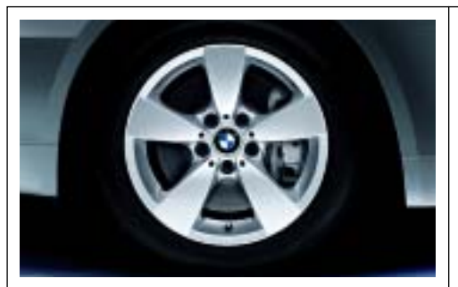
■ 17 x 7.5 Star Spoke (Styling 138) cast alloy wheels and 225/50R-17 all-season tires.