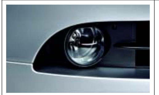
■ Halogen free-form foglights, integrated into the deep front spoiler, enhance your margin of safety in bad visibility. Ellipsoid free-form technology provides even light distribution on the road.

■ Xenon Adaptive Headlights provide brilliant clarity of the road ahead and to the side at night and in conditions with poor visibility. The dynamic auto-leveling feature adjusts for varying passenger and cargo loads, helping to keep headlight glare out of the eyes of oncoming drivers. BMW Adaptive Headlights provide optimum road illumination around corners, thanks to an electromechanical control system that directs the headlights into and through the bend as soon as the vehicle begins cornering.