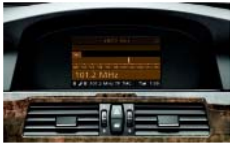
□ High Definition Radio (HD Radio<sup>TM</sup>) incorporates exclusive technology developed by iBiquity Digital Corporation. Among the many benefits of HD Radio is CD-quality sound, virtually free of the static and hiss that is often associated with analog radio. FM reception becomes CD quality, while AM reception becomes equivalent to present FM analog reception.