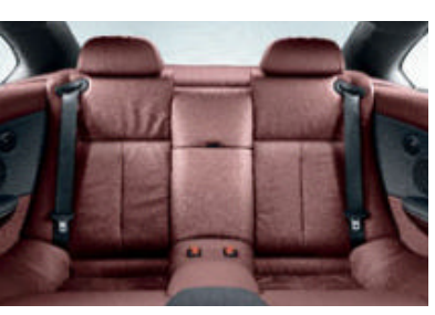
■ Rear cabin securely holds two passengers. The ergonomic belt system includes centermounted buckles, two three-point safety belts and head restraints. (650i Coupe shown)

□ Eight-way power front sport seats offer four-way power lumbar support and adjustable headrests with Active Head Restraints. Thanks to specially padded, highly contoured side bolsters, sport seats provide optimum lateral support during tight cornering, while remaining exceptionally comfortable when driving over long distances. The seats have power adjustments for seat height, backrest angle, seat bottom angle and forward/backward position; includes manual adjustment for thigh support and headrest. (available only with optional Sport Package; power headrest adjustment in 650i Convertible sport seats)