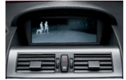
□ Night Vision is BMW's amazing system that lets you see pedestrians or animals in the dark – up to 1640 feet ahead. Using an infrared camera built into the front of the vehicle, you will be able to see potential road hazards displayed on your Navigation system monitor, and avoid them well before they are visible to the naked eye. At higher speeds, a digital zoom provides enlarged images of more distant objects on the screen.