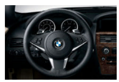
■ 3-spoke leather-wrapped multi-function sport steering wheel offers controls for audio system, cruise control and (accessory) phone. It also includes Voice Activation to let you keep both hands on the wheel while verbally adjusting various functions.