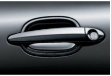
■ Door handles in body color combine sleek design and comfortable use.