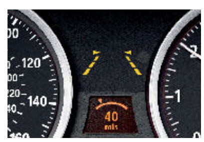
□ Lane Departure Warning feature<sup>2</sup> alerts the driver by discreetly vibrating the steering wheel if the vehicle crosses lane markings without using the directional signal.