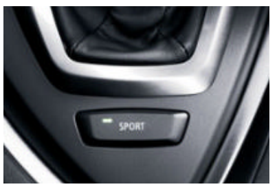
■ Dynamic Driving Control (Sport button), when activated, quickens the vehicle's response and performance for more dynamic steering, acceleration and gear shift changes.