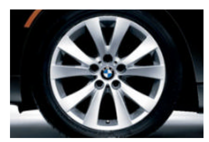
■ 18 x 8.0 V-Spoke (Style 248) cast alloy wheels and 245/45R-18 run-flat<sup>2</sup> all-season tires.

Due to low-profile tires, please note: wheels, tires and suspension parts are more susceptible to road hazard and consequential damages. Performance tires are not recommended for driving in snow and icy road conditions. Run-flat tires do not come equipped with a spare wheel and tire.