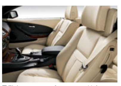
■ Eight-way power front seats with four-way power lumbar support and two-way adjustable headrests firmly support the driver and front passenger over long distances. Front-seat bolsters help eliminate "submarining" during sudden stops. Includes Active Head Restraints and driver's-seat memory function for settings. (shown in Cream Beige Dakota Leather upholstery)