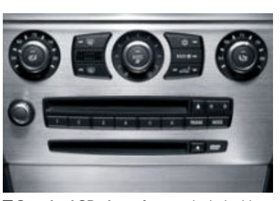
■ Standard CD player features include title scan, power-assisted CD insert/eject, and MP3 CD playback.