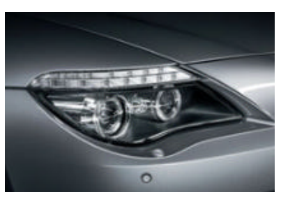
■ White LED turn indicators are an attractive functional detail that add to the new BMW 6 Series' sporty style.