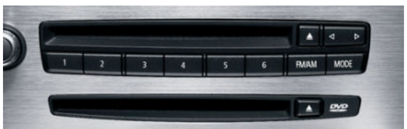
Six-disc CD changer is included with the optional Logic7 premium audio system. Conveniently located in the center dash, it lets you enjoy over six continuous hours of your favorite music and is capable of MP3 playback.

<sup>1</sup> 650i Coupe has 13 upgraded speakers; 650i Convertible has 11 upgraded speakers.