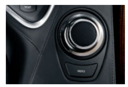
■ iDrive Controller, conveniently located on the center console, allows access to a variety of functions that are displayed on the color monitor. The turn/press button enables frontseat occupants to access the menu system and fine-tune settings for climate control, the audio system, and communication through BMW Assist.™