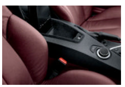
iPod and USB adaptor with cable connector lets you integrate the iPod, iPhone™ and other MP3 players into the audio system, and control various audio functions through the iDrive Controller or the multifunction buttons on the steering wheel.