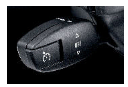
■ Cruise control lets you store and maintain a chosen speed above approximately 18.5 mph (activated via the left-hand side steering column switch). Cruise control is deactivated by applying the brakes or moving the lever.