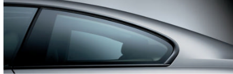
Shadowline with a Black High-Gloss finish gives a sporty look to front and rear side-window frames, window recess finishers, and door-sill trim strips. (650i Coupe shown)

Due to low-profile tires, please note: wheels, tires and suspension parts are more susceptible to road hazard and consequential damages. Performance tires are not recommended for driving in snow and icy road conditions. Run-flat tires do not come equipped with a spare wheel and tire.