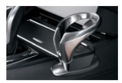
■ Cupholders – one front, one rear – can be easily inserted into place as needed, or removed and stored in the auxiliary storage bin in the rear center console.