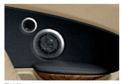
■ HiFi stereo speaker system brings sound to brilliant life through 10 speakers. □ Logic7 Premium Sound System with DSP (Digital Sound Processing) is channeled through 13 speakers in the 6 Series Coupe, 11 in the Convertible. The central bass allows highly authentic reproduction of bass frequencies via sill-mounted subwoofers. (included in Premium Sound Package)