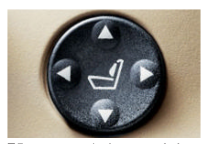
■ Four-way power lumbar support for front seats offers comfort and lower back muscle support. Lumbar support can be adjusted four ways: up/down and in/out.