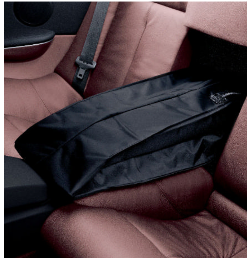
Ski bag allows clean and secure transport of up to four pairs of skis and ski poles. When not extended for use, the ski bag is stored out of sight behind the center armrest.

Cold Weather Package lets you enjoy winter to the fullest. There's nothing like the feel of a quick-warming seat and a heated steering wheel on a cold morning or stormy night – and the reassurance that your skis and other items are secured inside.