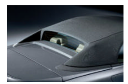
■ Automatic fin roof Convertible softtop is triple-lined and fully automatic. Simply press a button at the front of the center console to raise or lower. The top automatically unlatches from the header and folds down neatly. An interior lining helps reduce wind noise and enhances insulation. The heated glass rear window can be raised or lowered independently of the softtop. Available in Black or Gray. (650i Convertible only)

■ Tilting glass panel roof gives the interior an even brighter, more spacious feel. For greater ventilation, it tilts up; an electric sliding interior roofliner keeps the hot sun out. (650i Coupe only)