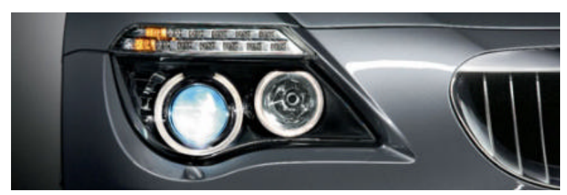
■ Xenon Adaptive Headlights are incorporated into the redesigned headlight cluster with all-clear lenses. The Adaptive Headlights function provides optimum road illumination around corners, thanks to an electromechanical control system that directs the headlights into and through the bend as soon as the vehicle begins cornering. Xenon headlights provide brilliant clarity of the road ahead and to the side, both at night and in conditions with poor visibility. The dynamic auto-leveling feature adjusts for varying passenger and cargo loads, helping to keep headlight glare out of the eyes of oncoming drivers. The Corona light-rings that circle both the headlights and high beams also act separately as Daytime Running Lights and parking lights.