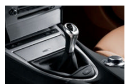
■ 6-speed manual transmission delivers a precise, athletic feel that's responsive to your personal driving style. This is due, in part, to the enhanced synchronization of shifts from neutral to each gear. The gearbox adds to the sporty feel, with a shortened shift lever and throw.