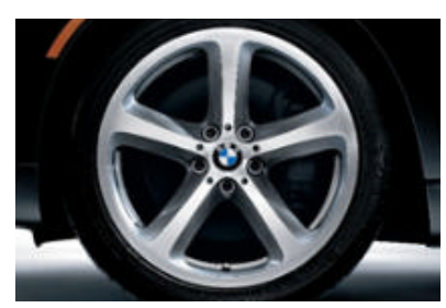
☐ 19 x 8.5 Star Spoke (Style 249) forged alloy wheels and 245/40R-19 run-flat performance tires.<sup>3</sup> (included in 6 Series Sport Package)

<sup>2</sup> Run-flat tires do not come equipped with a spare wheel and tire.