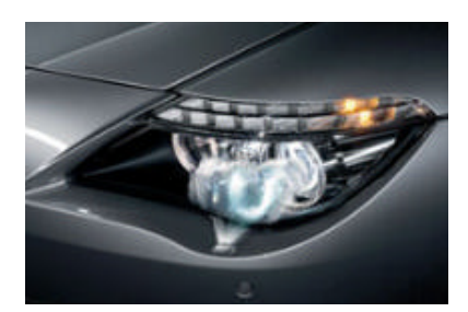
■ High-pressure headlight cleaning system helps keep headlights clear of ice, mud, road salt and other coatings, for maximum road illumination and enhanced driving safety.