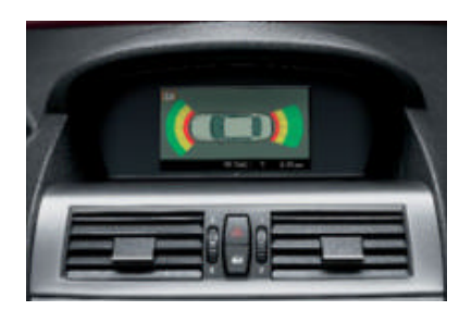
■ Park Distance Control (PDC), front and rear, helps parking and maneuvering in tight spaces. The distance between your vehicle and an obstacle is indicated by an acoustic signal that increases in intensity as your bumper approaches the object, turning into a constant tone when the distance closes to 12 inches. A visual representation is also projected on the iDrive Control display.

<sup>3</sup> Active Cruise Control is not a substitute for the driver's own responsibility in adjusting speed and otherwise controlling the vehicle. After evaluating road, traffic and visibility conditions, the driver must decide whether and how the system is used.