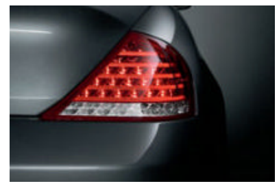
■ Adaptive Brake Lights help following drivers judge your braking intensity. Under light braking, the lower three rows of long-life LEDs in the rear brake-light unit illuminate. During panic braking, Dynamic Brake Control (DBC) signals for the two upper rows of LEDs to illuminate. For 2008, the brake-light strip on the trunk (not shown) has been made wider and moved to the top of the spoiler lip.