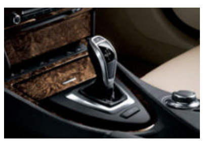
☐ 6-speed Sport Automatic transmission provides extremely fast synchronized shifting, whether performed by the automatic shift mode or by means of the Formula 1-inspired steering wheel-mounted paddle shifters. (no-cost option)