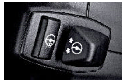
Heated steering wheel makes gloves unnecessary for cold-weather driving. A flick of the switch quickly warms the steering wheel to the perfect temperature.