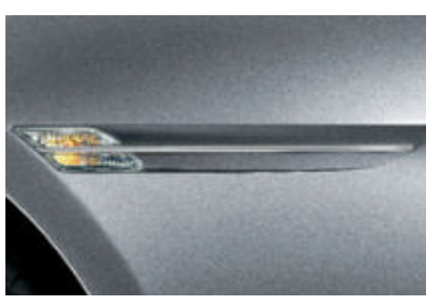
■ Side indicator lights add to the 6 Series' distinctive individuality.