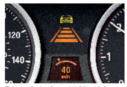
□ Active Cruise Control (ACC) with Stop & Go allows the driver to preset a desired speed. When ACC recognizes slower-moving vehicles ahead, it automatically brakes to maintain a preset distance, then resumes the set speed as soon as possible.¹ In traffic, Stop & Go can reduce the speed down to a standstill. (requires optional Sport Automatic transmission)