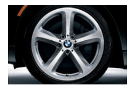
19 x 8.5 Star Spoke (Style 249) forged alloy wheels and 245/40R-19 run-flat performance tires.<sup>1</sup>

Eight-way power front sport seats offer four-way power lumbar support and adjustable headrests with Active Head Restraints. Thanks to specially padded, highly contoured side bolsters, sport seats provide optimum lateral support during tight cornering, while remaining exceptionally comfortable when driving over long distances. The seats have power adjustments for seat height, backrest angle, seat bottom angle and forward/backward position; includes manual adjustment for thigh support and headrest. (available only with optional Sport Package; power headrest adjustment in 650i Convertible sport seats)