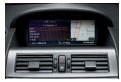
■ BMW anti-theft AM/FM stereo/CD MP3 player audio system features include Auto-Store and FM diversity antenna system.