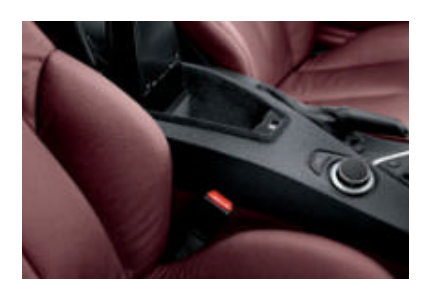
■ Front armrest offers two height positions and includes a storage bin for small items. ■ Auxiliary input port lets you connect an

external audio source, such as an iPod® or MP3 player.