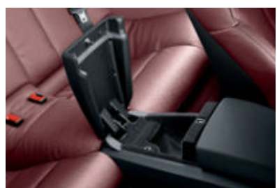
■ Auxiliary storage is located in the rear of the center console.

external audio source, such as an iPod® or MP3 player.