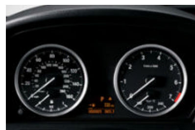
■ Easy-to-read information display with precise, dazzle-free analog indicators. Data, such as trip mileage counter, can be checked by using the LCD displays on the instrument panel.