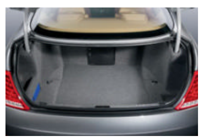
■ Luggage compartment (6 Series Coupe shown) is fully lined and easily accessible. Stow two golf bags and additional luggage with ease. Includes four lashing eyelets and side bins for safe storage of smaller items.