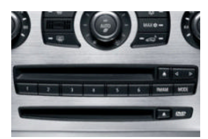
■ Six programmable memory keys offer convenient storage of your most frequently accessed iDrive settings, such as favorite radio stations, Navigation system addresses, phone numbers and more.