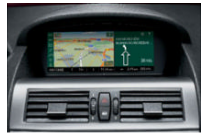
■ Navigation system covers the U.S. with a single DVD. Accessed via Voice Activation or through the iDrive Controller, the Navigation system uses GPS satellites and DVD technology to create a map of your area on the glare-free dash monitor. The system shows – and tells – the direction to your desired destination; it also provides Real Time Traffic Information on potential traffic problems and solutions.