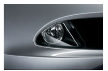
■ Halogen free-form foglights, built into the front air dam, enhance your margin of safety in bad visibility. Ellipsoid free-form technology provides for even light distribution on the road.