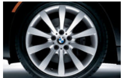
☐ 19 x 8.5 Star Spoke (Style 218) cast alloy wheels and 245/40R-19 run-flat performance tires.<sup>1</sup>

Due to low-profile tires, please note: wheels, tires and suspension parts are more susceptible to road hazard and consequential damages. Performance tires are not recommended for driving in snow and icy road conditions. Run-flat tires do not come equipped with a spare wheel and tire.