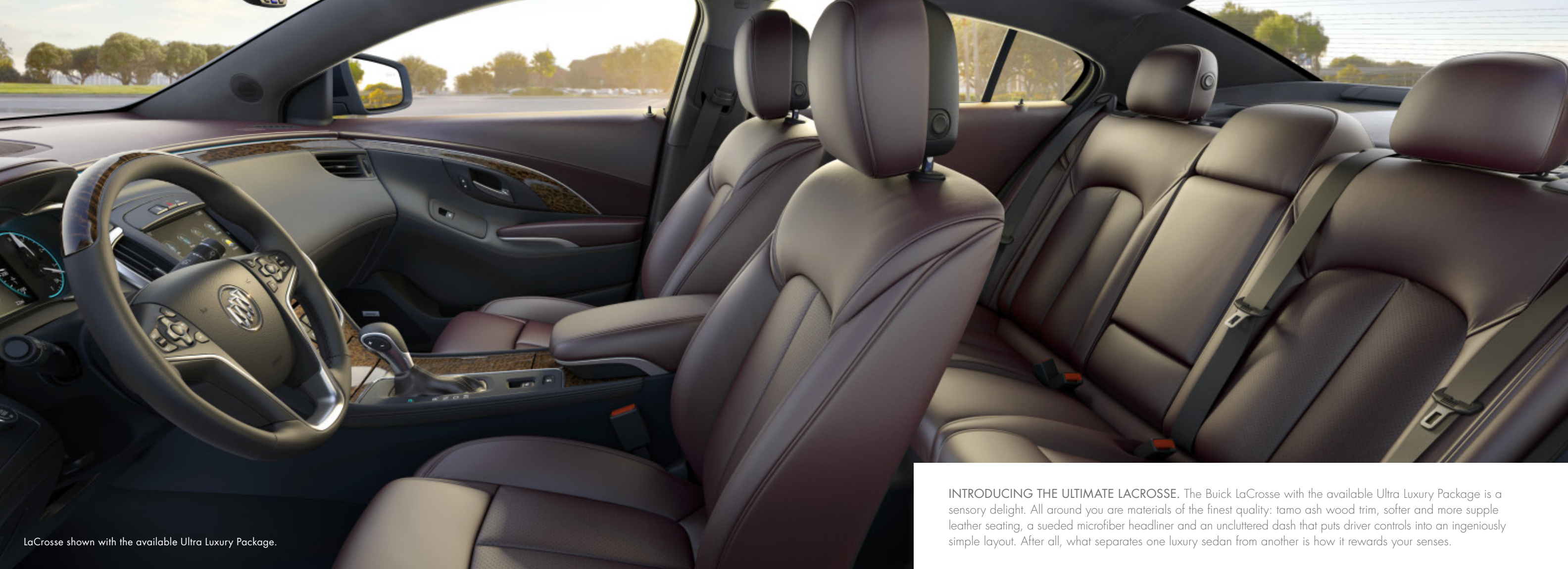
LaCrosse shown with the available Ultra Luxury Package.

INTRODUCING THE ULTIMATE LACROSSE. The Buick LaCrosse with the available Ultra Luxury Package is a sensory delight. All around you are materials of the finest quality: tamo ash wood trim, softer and more supple leather seating, a sueded microfiber headliner and an uncluttered dash that puts driver controls into an ingeniously simple layout. After all, what separates one luxury sedan from another is how it rewards your senses.