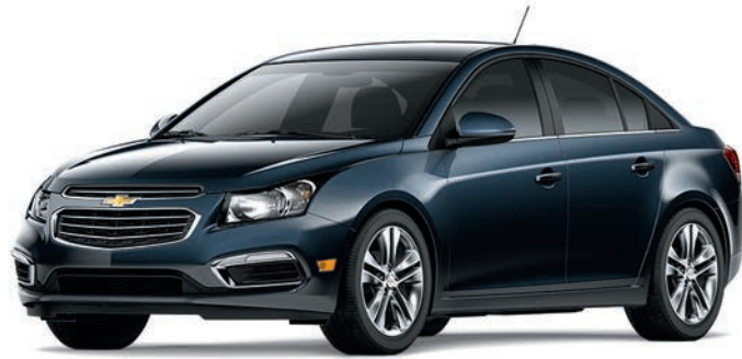
BLUE RAY METALLIC 1