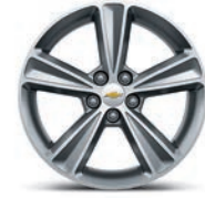
17" 5-Spoke Flangeless Aluminum (Standard on 2LT)