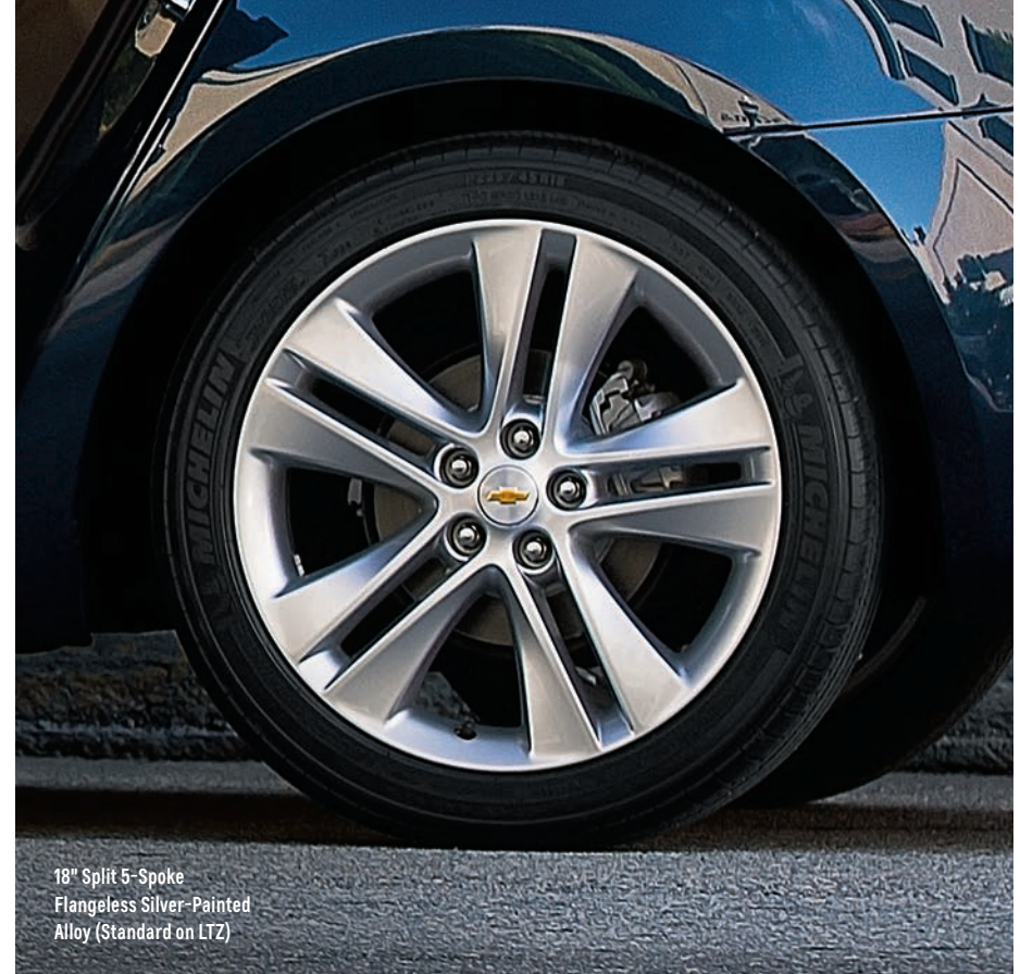
18" Split 5-Spoke Flangeless Silver-Painted Alloy (Standard on LTZ)