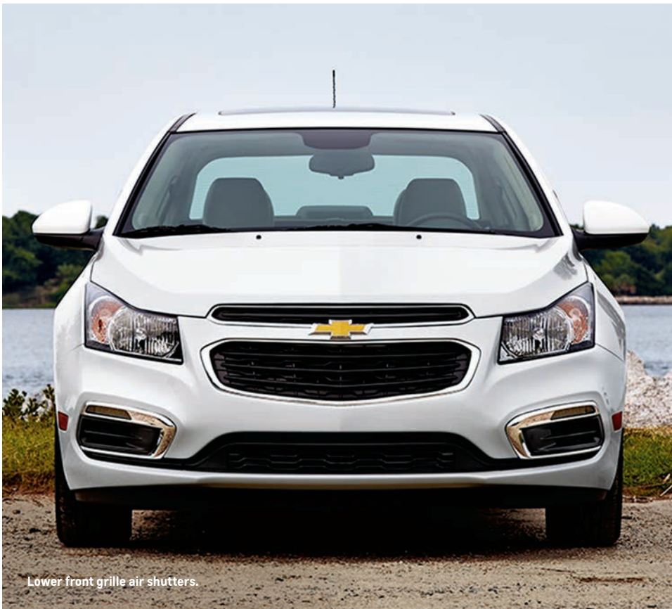
Lower front grille air shutters.