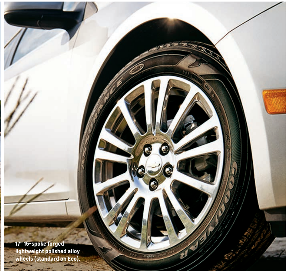
17" 15-spoke forged lightweight polished alloy wheels (standard on Eco).