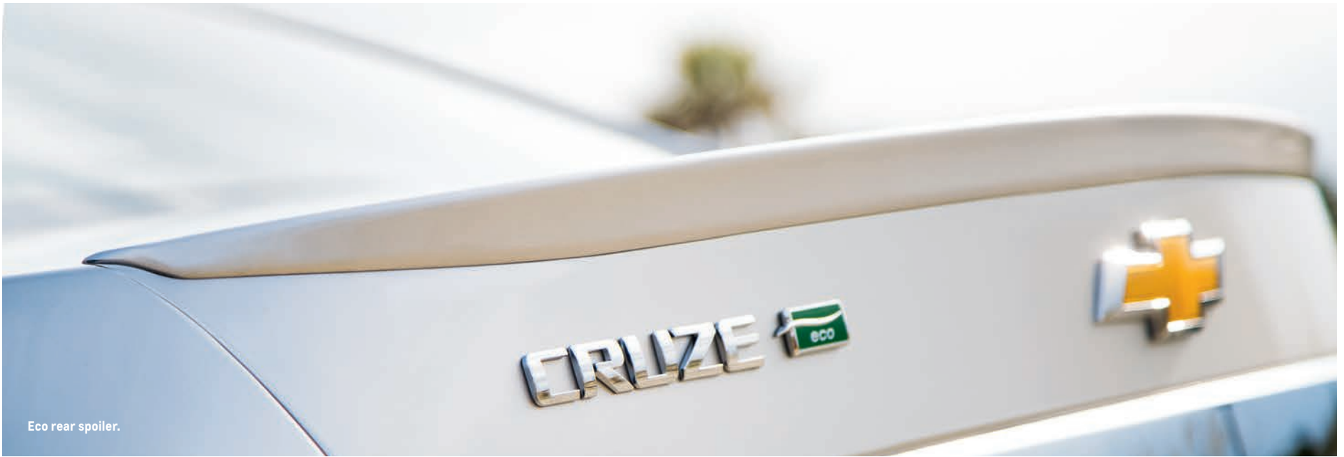
Eco rear spoiler.