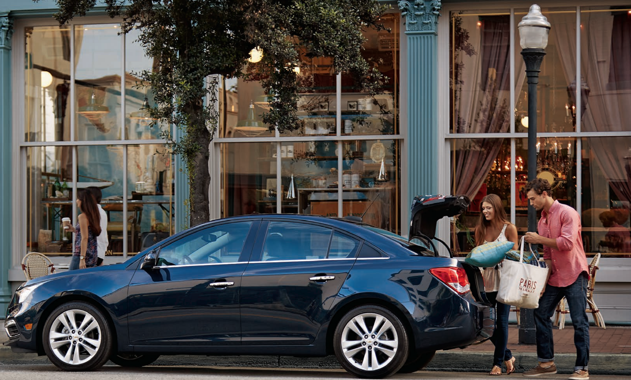
Cruze Limited LTZ in Blue Ray Metallic with available features.