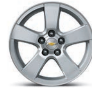
16" 5-Spoke Machined-Face Aluminum (Standard on 1LT)