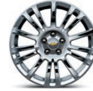
17" 15-Spoke Forged Lightweight Polished Alloy (Standard on Eco)