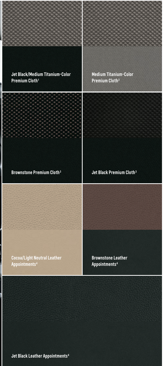
Jet Black Leather Appointments 4