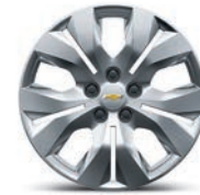
16" Silver-Painted Wheel Cover (Standard on L and LS)