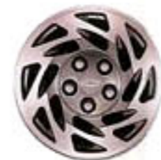
Optional 15" cast-aluminum wheels with locks