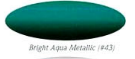
Bright Aqua Metallic (#43)

NOTE: Secondary color is always Light Gray Metallic with Gray Accents.