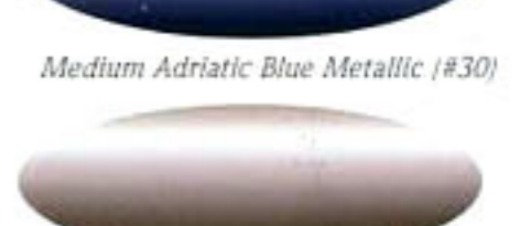
Medium Adriatic Blue Metallic (#30)