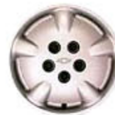
Standard 15" bolt-on full wheel covers