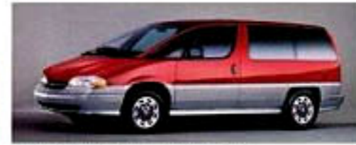
Custom Two-Tone (RPO D84)

NOTE: Secondary color is always Light Gray Metallic with Gray Accents.