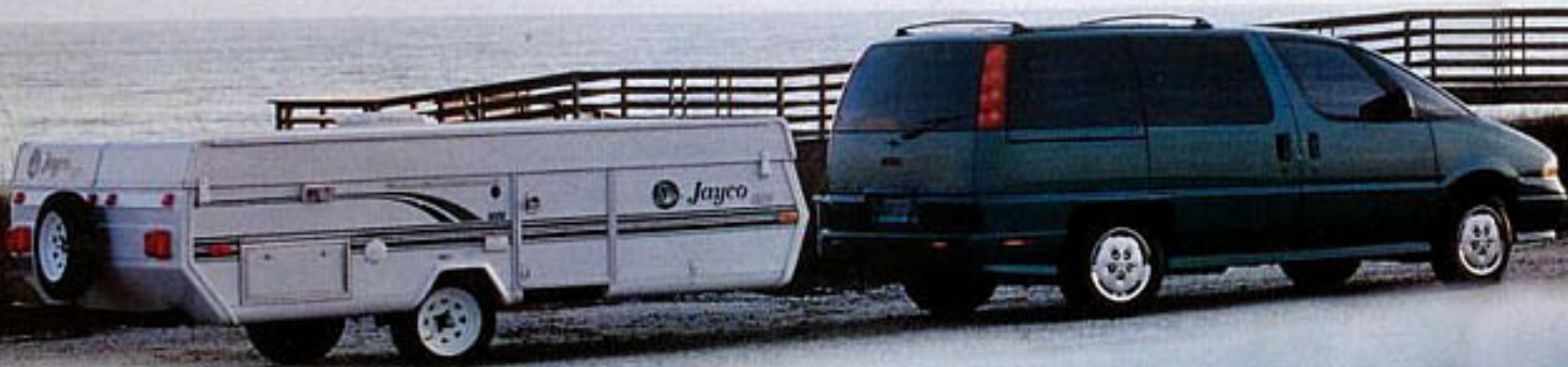
Lumina Minivan with optional LS luxury-level trim. Shown in Bright Aqua Metallic.

NOTE: The safety steps described here are by no means the only precautions to be taken when trailering. See the Owner's Manual for the Chevy vehicle of your choice for additional guidelines and trailering tips.