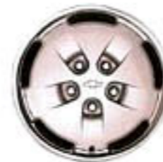
Custom 15" bolt-on wheel covers, included with LS trim