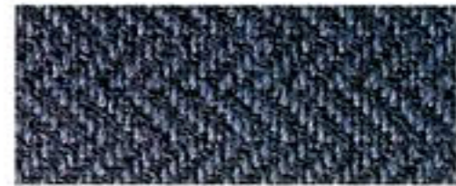
LS Custom Cloth