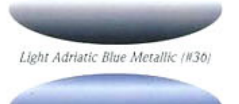
Light Adriatic Blue Metallic (#36)