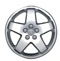
18" Machined-face Aluminum Wheel Standard on R/T