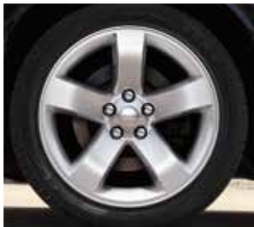
18-inch aluminum (standard on SXT, SXT Plus, R/T and R/T Plus)