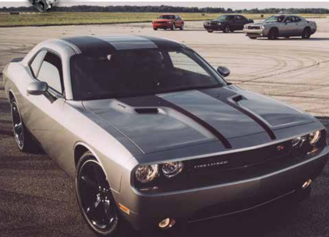
Challenger R/T Blacktop shown in Billet Silver Metallic with Blacktop stripes.

392-CU-IN SRT® HEMI V8 WITH 470 LB-FT OF TORQUE