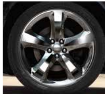
20-inch chrome-clad aluminum (included in Super Sport Group on SXT and SXT Plus and optional on R/T and R/T Plus)