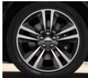
20-inch cast aluminum with Black pockets (standard on SRT® Core)