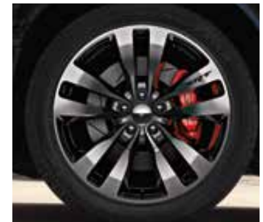
20-inch Black Vapor Chrome aluminum (optional on SRT Core and SRT 392)