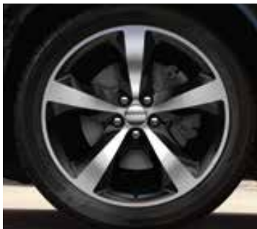
20-inch polished aluminum with Gloss Black pockets (standard on R/T Classic)