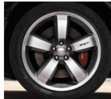
20-inch polished forged aluminum with Black pockets (standard on SRT 392)