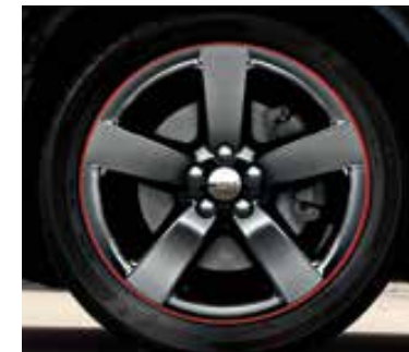
20-inch Black Chrome aluminum with Red lip/backbone (standard on Rallye Redline and included in R/T Redline Group on R/T and R/T Plus)