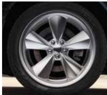
20-inch Heritage II polished forged aluminum (optional on R/T Classic)