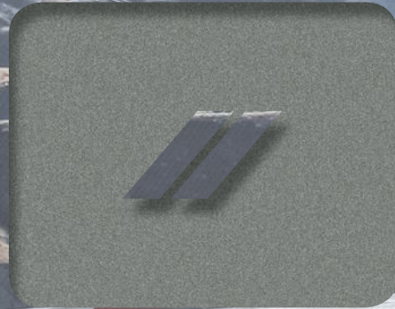
BILLET SILVER METALLIC