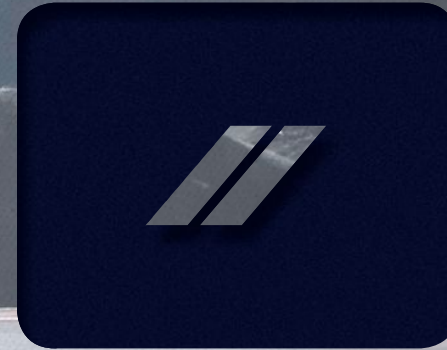
TRUE BLUE PEARL