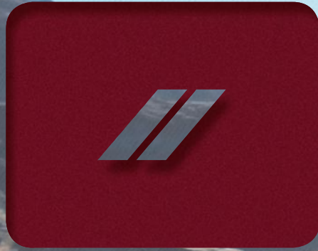
DEEP CHERRY RED CRYSTAL PEARL