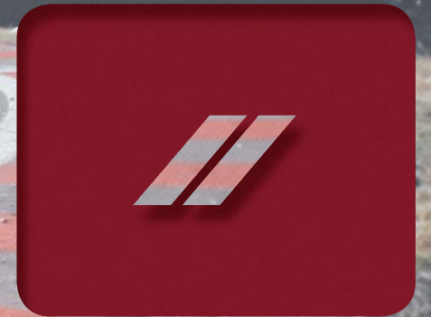
REDLINE RED 2 COAT PEARL