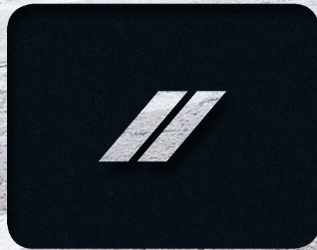
BLACK FOREST GREEN PEARL*