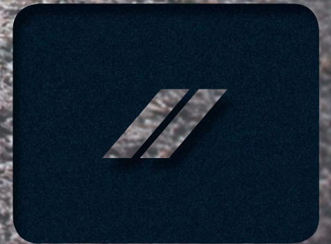
MAXIMUM STEEL METALLIC