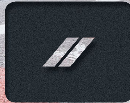
GRANITE CRYSTAL METALLIC