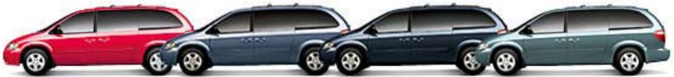
Inferno Red Crystal Pearl