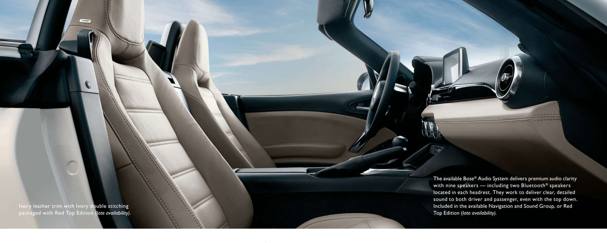
FIAT® 124 Spider Interior Colors