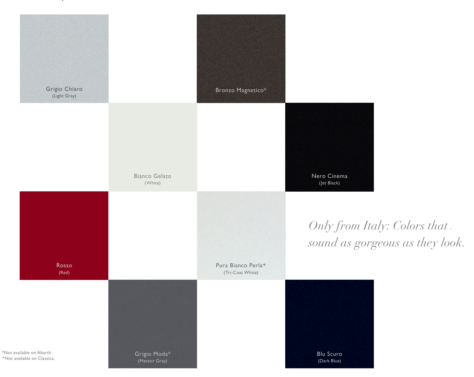
FIAT® 124 Spider Exterior Colors