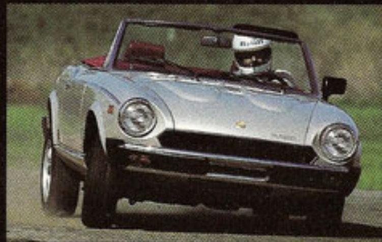
Road tested by Jody Scheckter, World Champion Ferrari Formula 1 driver.

"The Spider Turbo gives you the economy of a small engine - and the power of an engine twice the size."