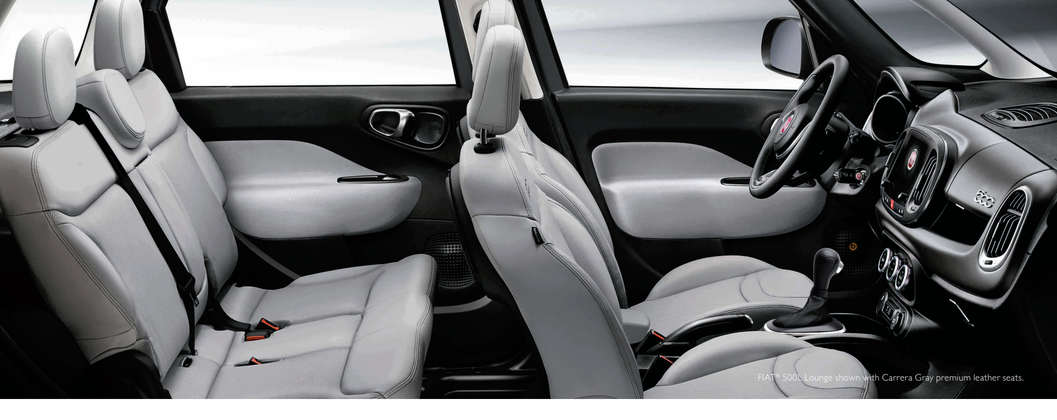
FIAT 500L Interior Colors