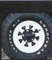
Painted styled steel 15 x 6 wheels (5). 15 x 8 wheels are included with 10 x 15 tires (4) or (5).