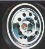
10-hole polished forged aluminum 15 x 6 wheels (4) with steel spare.