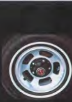
5-slot forged aluminum 15 x 6 wheels (4) with steel spare.

Color choices available are: 1. Raven Black, 2. Wimbledon White, 3. Candyapple Red, 4. Maroon Metallic, 5. Coral, 6. Silver Metallic, 7. Dark Blue Metallic, 8. Light Medium Blue, 9. Bright Emerald, 10. Dark Jade Metallic, 11. Light Jade, 12. Midnight Jade, 13. Gold Metallic, 14. Light Sand, 15. Dark Brown Metallic, 16. Medium Copper Metallic, 17. Bright Yellow. New optional glamour colors: 18. Medium Blue Glow, 19. Walnut Glow.