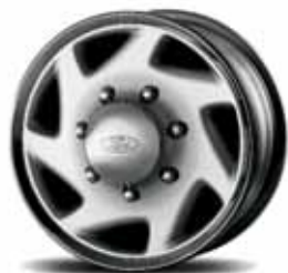
16" Steel with Sport Wheel Covers Standard