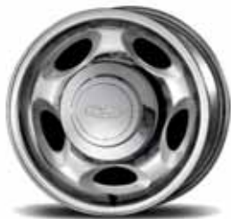
16" Aluminum Available