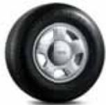
15" Styled-Steel Wheel Standard on XLS Manual and XLS