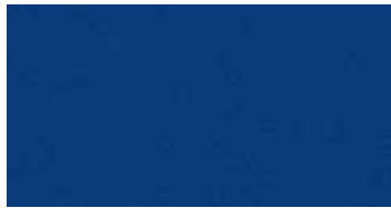
Sonic Blue Metallic