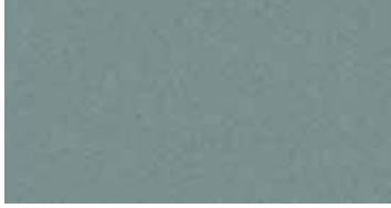
Titanium Green Metallic