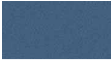
Norsea Blue Metallic