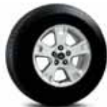
16" Aluminum Wheel Standard on XLT OWL tires standard on 4WD, optional on FWD