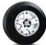
16" Bright Machined-Aluminum Wheel Standard on XLT Sport/ XLT No Boundaries Package/Limited OWL tires standard on XLT Sport and XLT No Boundaries Package