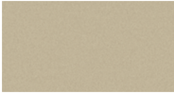
Gold Ash Metallic