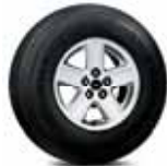
15" Aluminum Wheel Optional on XLS Manual and XLS