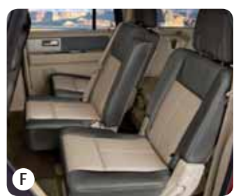
<sup>1</sup>Cargo and load capacity limited by weight and weight distribution. <sup>2</sup>Full-size SUV and Full-size Extended-length SUV classes.