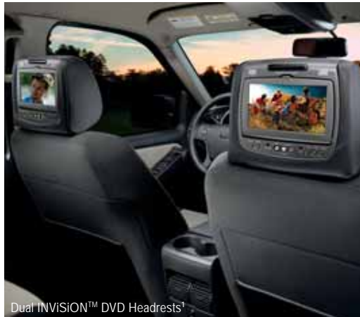
Dual INVISION™ DVD Headrests 1