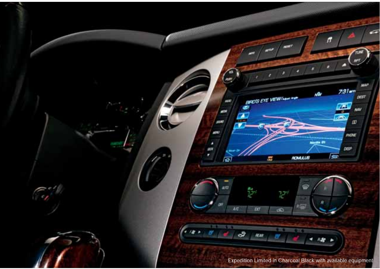
Expedition Limited in Charcoal Black with available equipment

Available SIRIUS Satellite Radio 1 comes with a 6-month subscription to get you surfing over 130 channels of sports, news, entertainment and 100% commercial-free music, coast-to-coast.