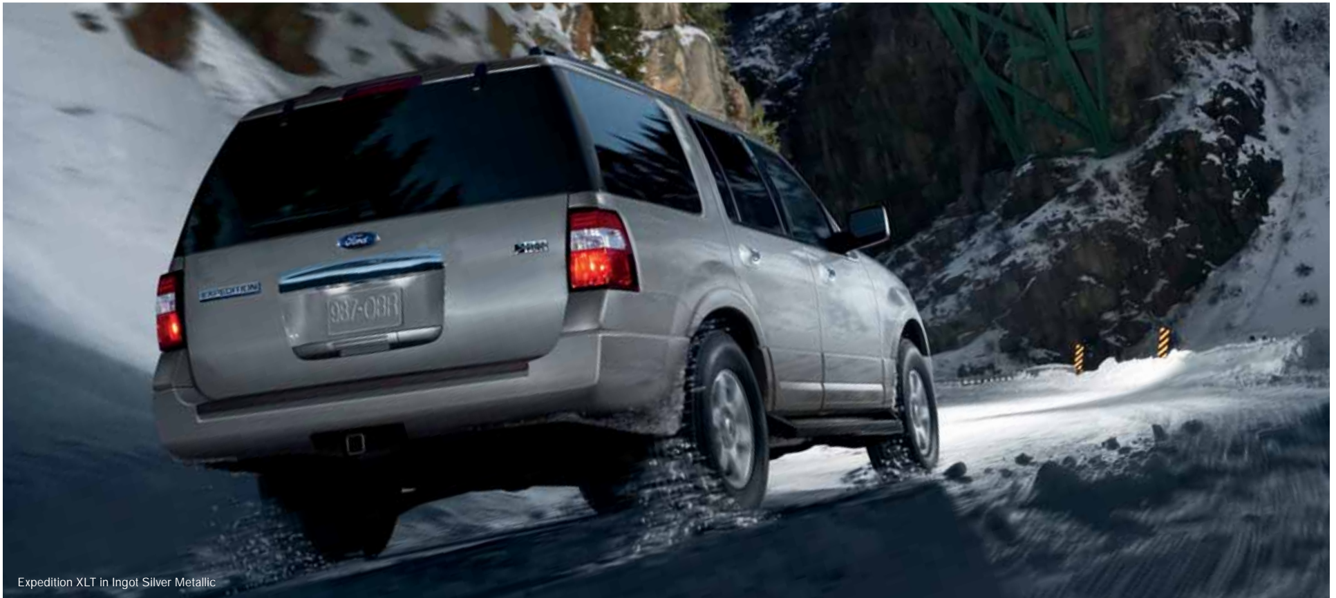
Expedition XLT in Ingot Silver Metallic