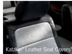
Katzkin® Leather Seat Covers 1