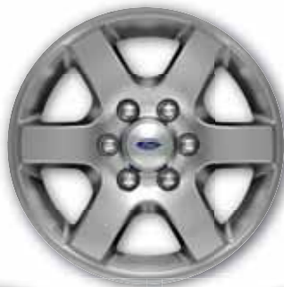
17" Aluminum Standard on XLT