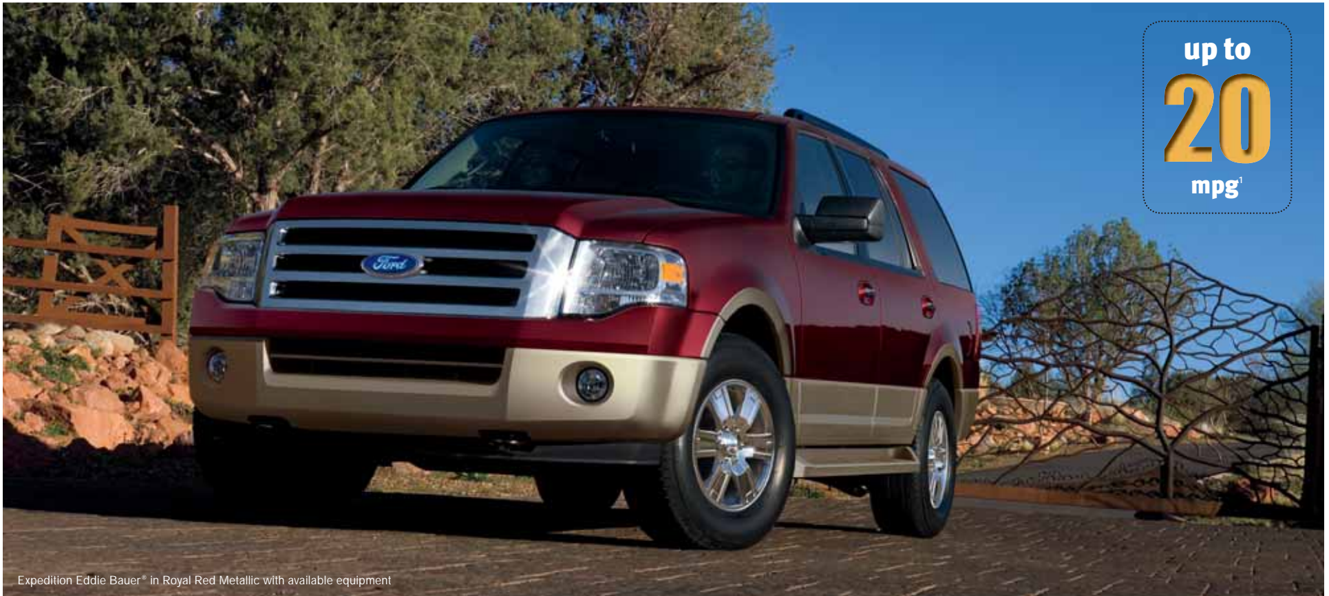
Expedition Eddie Bauer® in Royal Red Metallic with available equipment