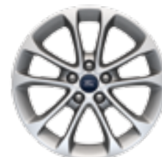
17" SPARKLE SILVER-PAINTED ALUMINUM Standard