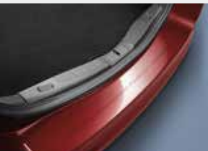
Rear bumper protector