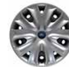
16" STEEL WITH SILVER-PAINTED COVERS Ⓞ Standard

CLOTH SEATING SURFACES: Medium Light Stone