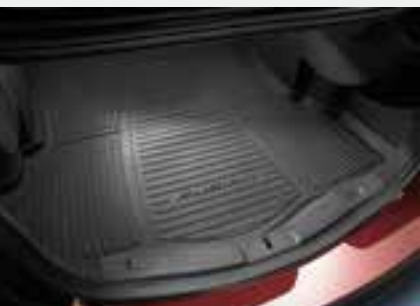
Cargo area protector

New Vehicle Limited Warranty. We want your Ford Fusion ownership experience to be the best it can be. Under this warranty, your new vehicle comes with 3-year/36,000-mile bumper-to-bumper coverage, 5-year/60,000-mile Powertrain Warranty coverage, 5-year/60,000-mile safety restraint coverage, and 5-year/unlimited-mile corrosion perforation (aluminum panels do not require perforation) coverage – all with no deductible. Fusion unique electric components are covered during the Hybrid/Electric Unique Component Coverage, which lasts for 8 years or 100,000 miles, whichever occurs first. Please ask your Ford Dealer for a copy of these limited warranties.