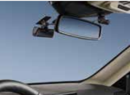
Dash cam systems 1