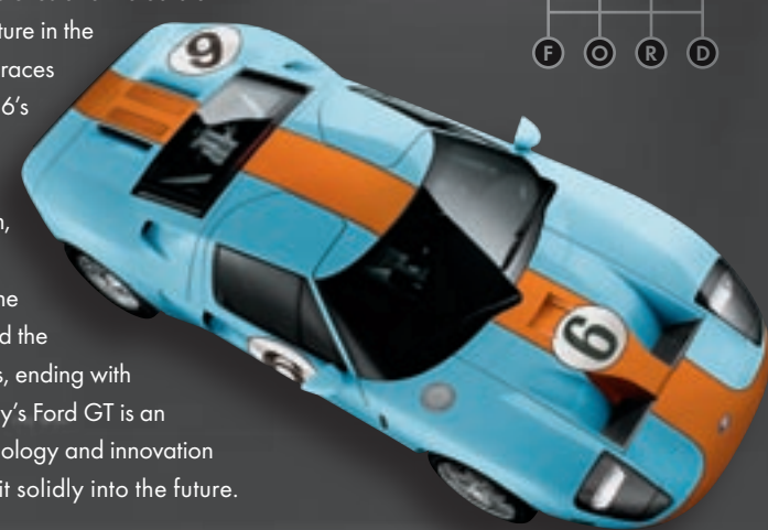
1966 24 HOURS OF LE MANS 1st place 2nd place 3rd place

Starting with nothing more than designers' sketches and incredible determination in 1963, the Ford GT was a fixture in the winner's circle of the world's most prestigious races just 3 short years later. The 1-2-3 finish at 1966's 24 Hours of Le Mans was the culmination of Henry Ford II's vision of making the Ford GT the dominant endurance racer of its generation, and marked the first time that an American manufacturer secured the checkered flag at the famed Grand Prix d'Endurance. 1966 marked the first of 4 consecutive years of wins at Le Mans, ending with 1969's razor-thin victory of 120 meters. Today's Ford GT is an epic engineering feat—one that proves technology and innovation can preserve a classic form while bringing it solidly into the future.