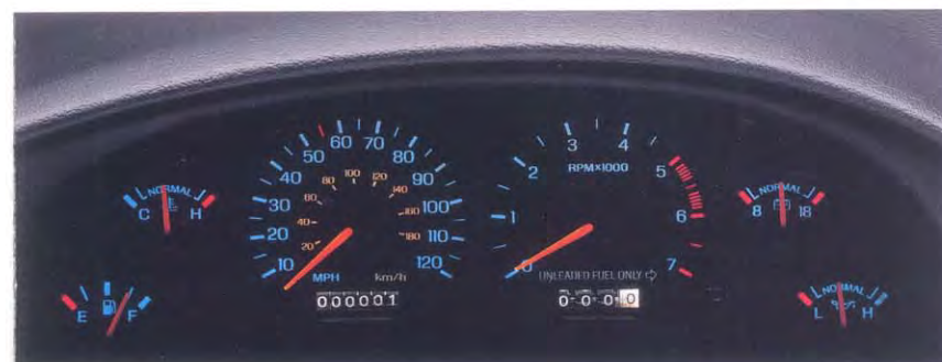
Mustang comes equipped with analog gauges: engine temperature, battery charge, fuel level and oil pressure. Plus a tachometer to read the pulse of the standard 3.8-liter V-6.

While Mustang is all-new in style and design, you may likely find technical sophistication to