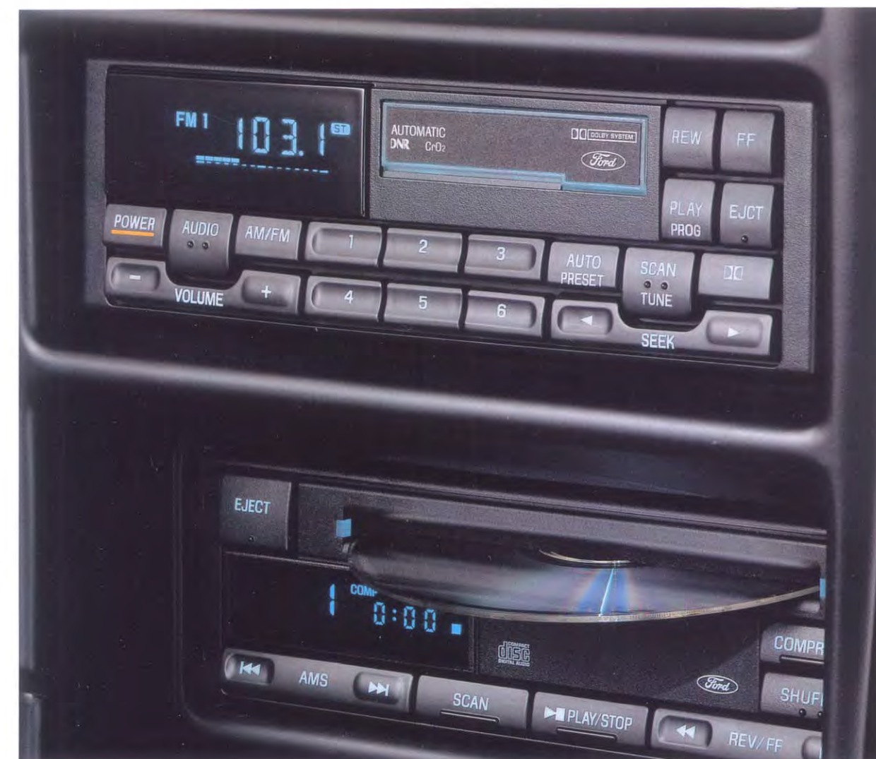
The optional high-performance Mach 460 electronic AM/FM stereo sound system with cassette tape player is available with an optional compact disc player.