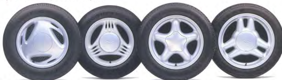
Left to right: 15" wheel covers (standard on Mustang); 15" cast aluminum wheels (optional on Mustang); 16" cast aluminum wheels (standard on Mustang GT); 17" cast aluminum wheels (optional on Mustang GT).

*Must be factory-ordered. See your dealer for date of availability and selection of colors. **Requires electronic AM/FM stereo/cassette premium sound system or the Mach 460 sound system.