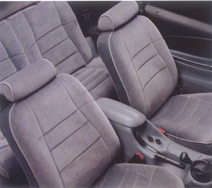
Standard Mustang cloth reclining front buckets with full center console in Opal Grey, one of five available colors.