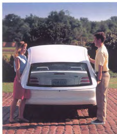
At right: Mustang convertible in Crystal White. It's shown with the optional factory-ordered removable hardtop (see your dealer for availability), which is easy to put on and take off and comes with a rolling stand and storage cover. Some other equipment shown is also optional.

With Mustang for 1994, you can have your hardtop coupe — and your convertible, too.