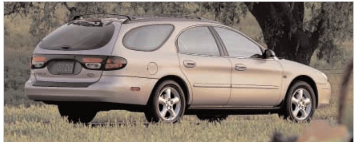
Taurus SE Wagon Premium shown in Arizona Beige.