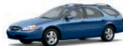
PATRIOT BLUE METALLIC

Ford Taurus features clearcoat paint for beauty and protection. All Taurus models are available in all colors. Vehicles may be shown with optional equipment.