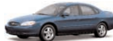
MEDIUM TRUE BLUE METALLIC