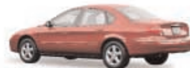
MATADOR RED METALLIC