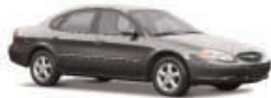
DARK SHADOW GREY METALLIC