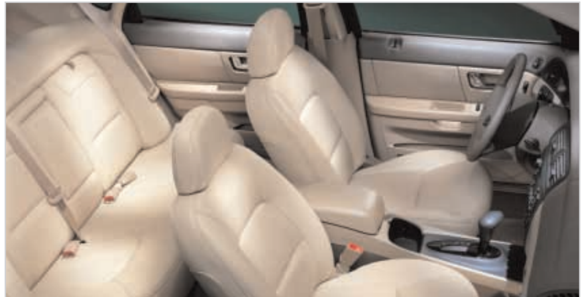
Taurus SEL shown with optional Medium Parchment leather seating surfaces.

Chrome door handles enhance every Taurus interior (a). Electronic automatic temperature controls (b) on SEL mean no fumbling for the "just-right" setting. Optional power adjustable pedals (c) ensure a comfortable driving position. A single-disc CD system (d) is available. Another smart touch – automatic headlamps (e) on SEL models. Say goodbye to remembering to turn on ... or off ... your lights.