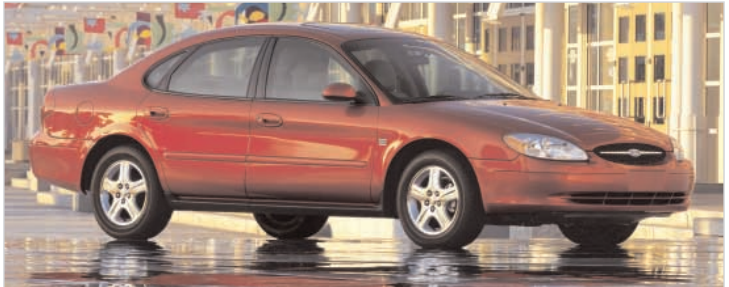
Taurus SEL Deluxe shown in Matador Red and with optional equipment.

It's no secret why so many people develop such an immediate connection with Taurus. Even for those who've just met, there's a feeling of trust that comes from its quick response and its generous 200-horsepower engine (optional). You just know it's going to be there for you when life throws you a hairpin curve.