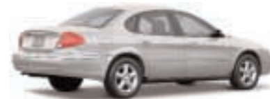
SILVER FROST METALLIC