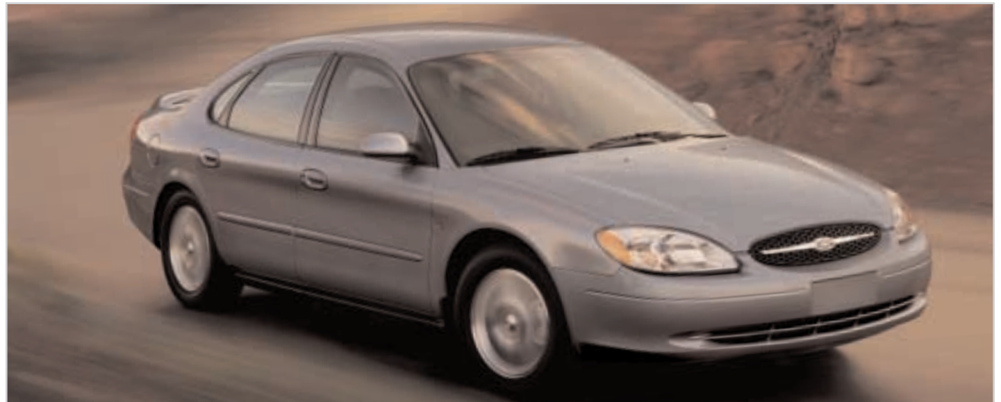
Taurus SEL Premium shown in Dark Shadow Grey and with optional equipment.

HE JUST HAPPENS TO NOW HAVE FOUR DOORS AND DISC BRAKES.