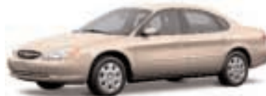
ARIZONA BEIGE METALLIC