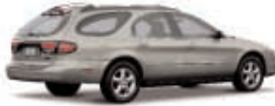
SPRUCE GREEN METALLIC