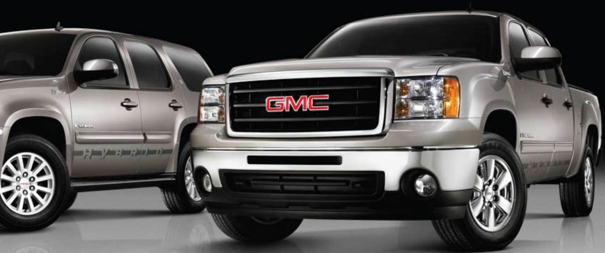
YUKON HYBRID SHOWN IN SILVER BIRCH METALLIC WITH AVAILABLE EQUIPMENT