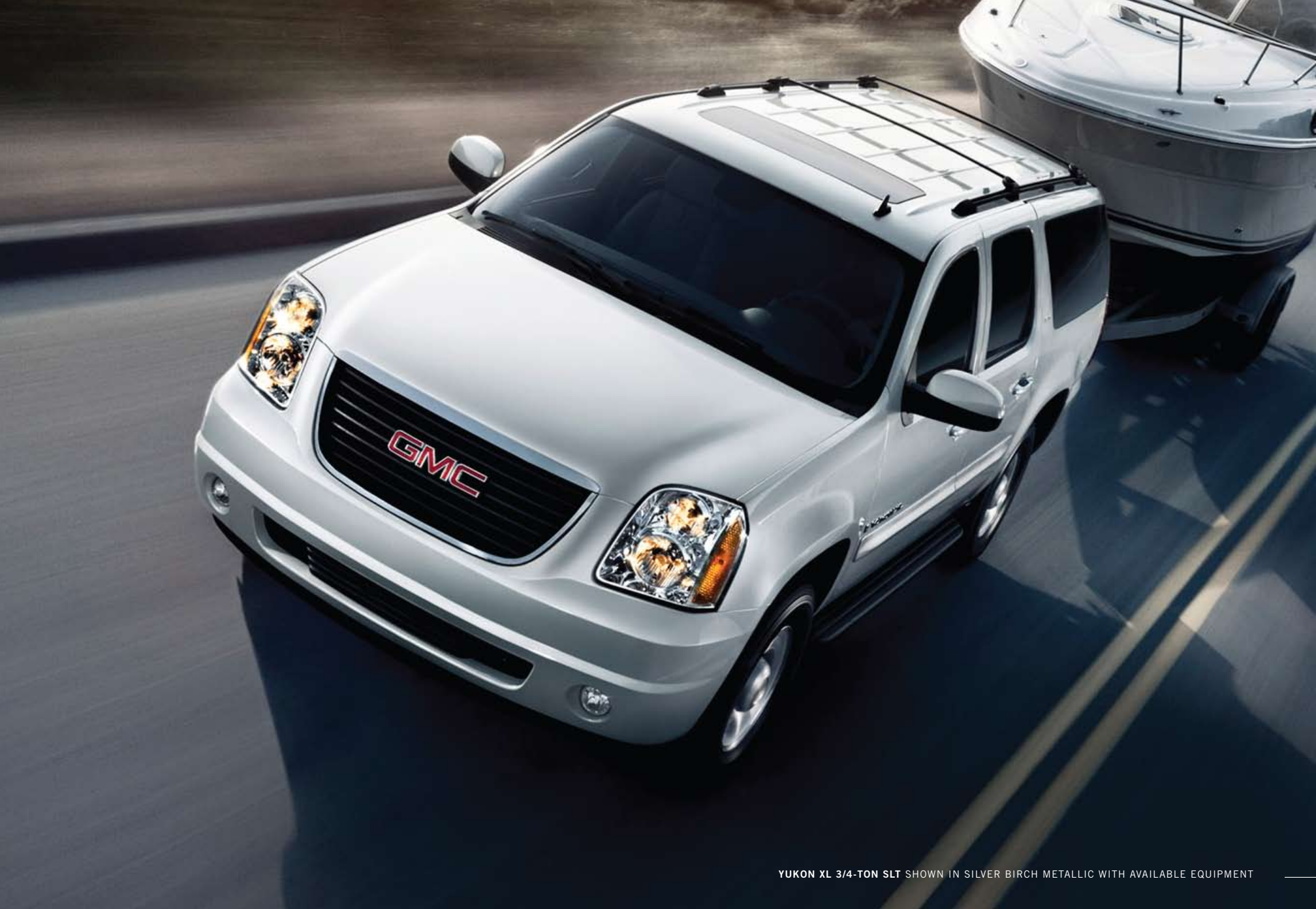
YUKON XL 3/4-TON SLT SHOWN IN SILVER BIRCH METALLIC WITH AVAILABLE EQUIPMENT