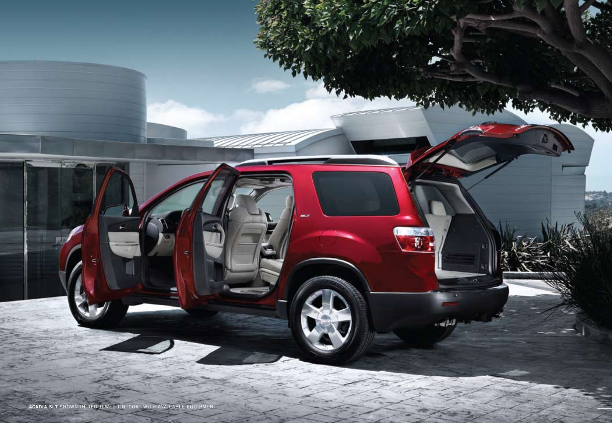
ACADIA SLT SHOWN IN RED JEWEL TINTCOAT WITH AVAILABLE EQUIPMENT