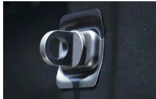
UPPER MOVABLE TIE-DOWN HOOKS