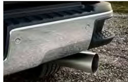
CORNERSTEP REAR BUMPER