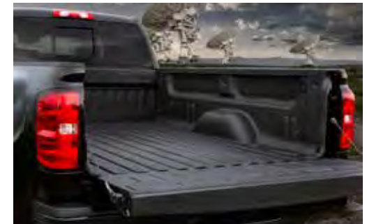
AVAILABLE EZ-LIFT AND LOWER TAILGATE