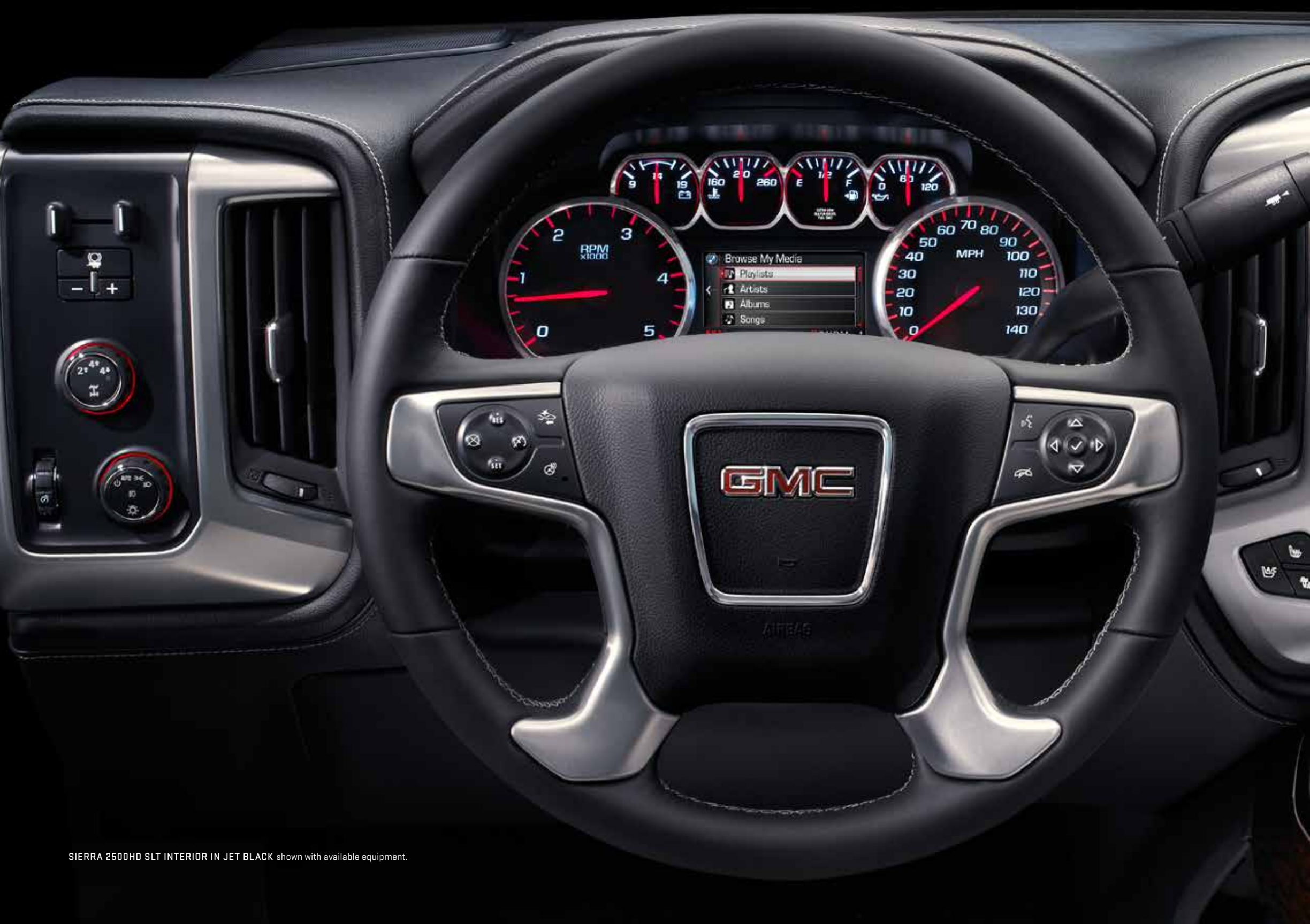
SIERRA 2500HD SLT INTERIOR IN JET BLACK shown with available equipment.