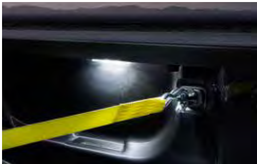
AVAILABLE UNDER-RAIL BOX LIGHTS