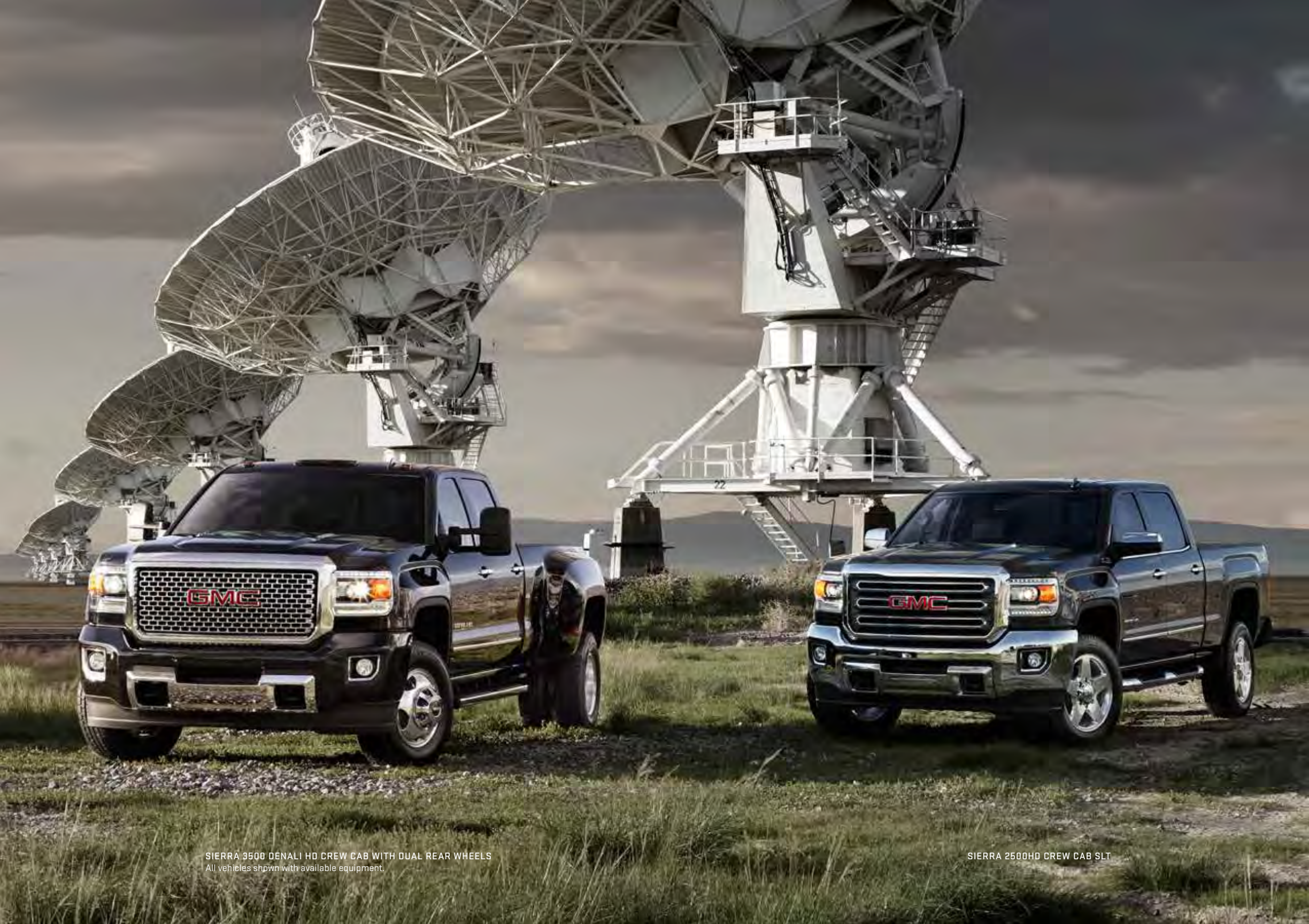
SIERRA 3500 DENALI HD CREW CAB WITH DUAL REAR WHEELS All vehicles shown with available equipment.