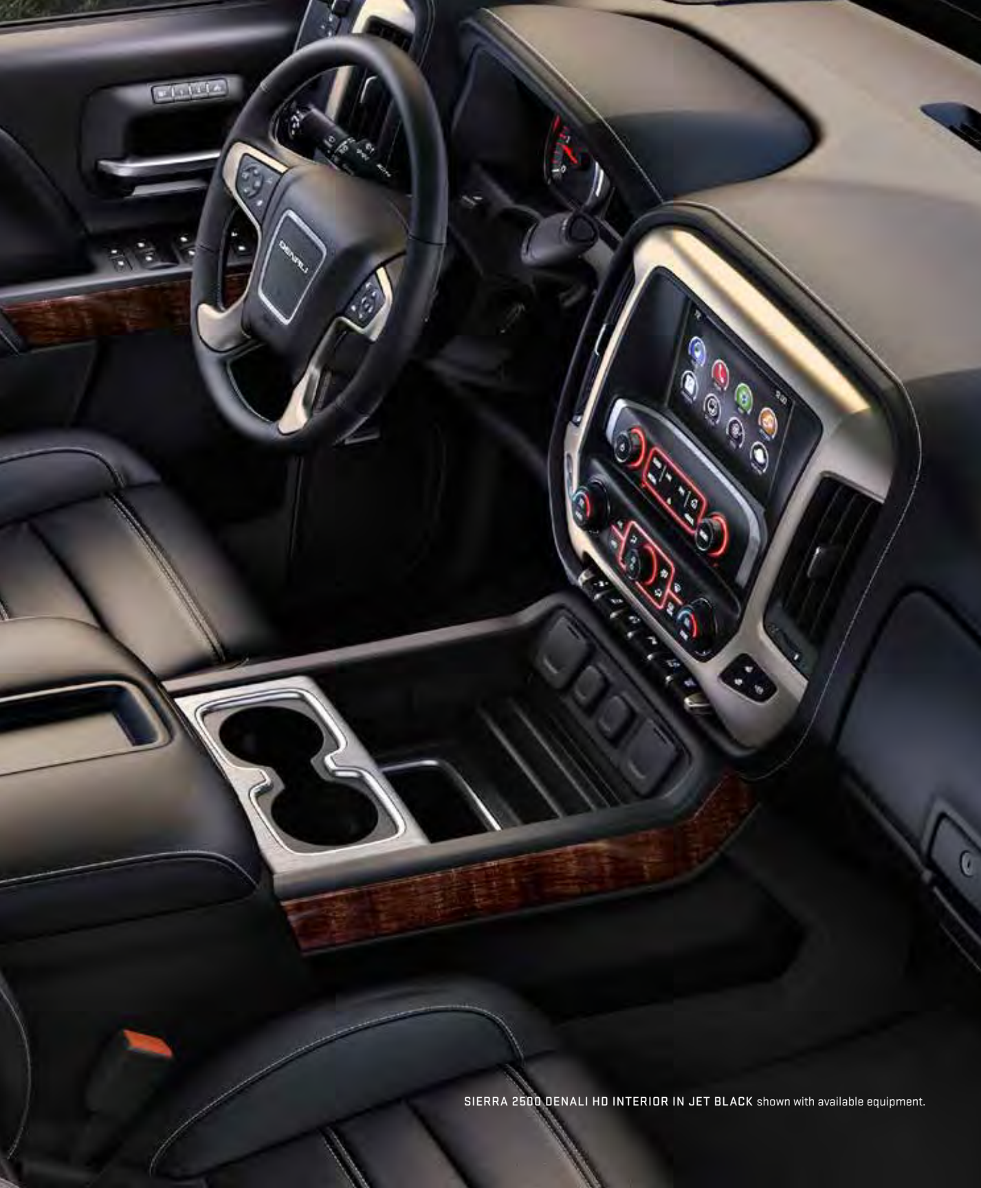
SIERRA 2500 DENALI HD INTERIOR IN JET BLACK shown with available equipment.