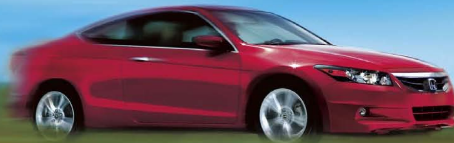
Accord EX-L V-6 Coupe shown in San Marino Red.

For an extra helping of athletic ability, try the Accord EX-L V-6 6-speed Coupe. Its short-throw shifter gives you pinpoint control over the vehicle's well-chosen gear ratios. Eighteen-inch alloy wheels also complement its sporting potential.