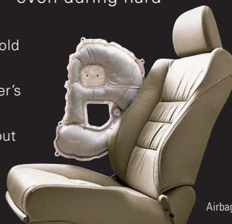
Airbags inflated for display purposes.

*VSA is not a substitute for safe driving. It cannot correct the vehicle's course in every situation or compensate for reckless driving. Control of the vehicle always remains with the driver.