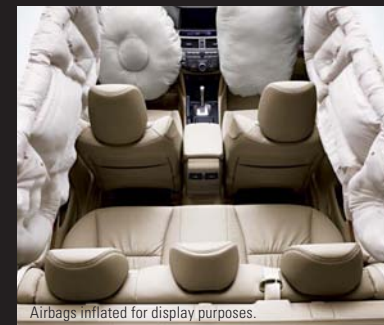
Airbags inflated for display purposes.

To help reduce the likelihood of whiplash injuries in a rear-end impact, the front seats have active head restraints. They move up and forward in a rear collision to help keep head movement to a minimum.