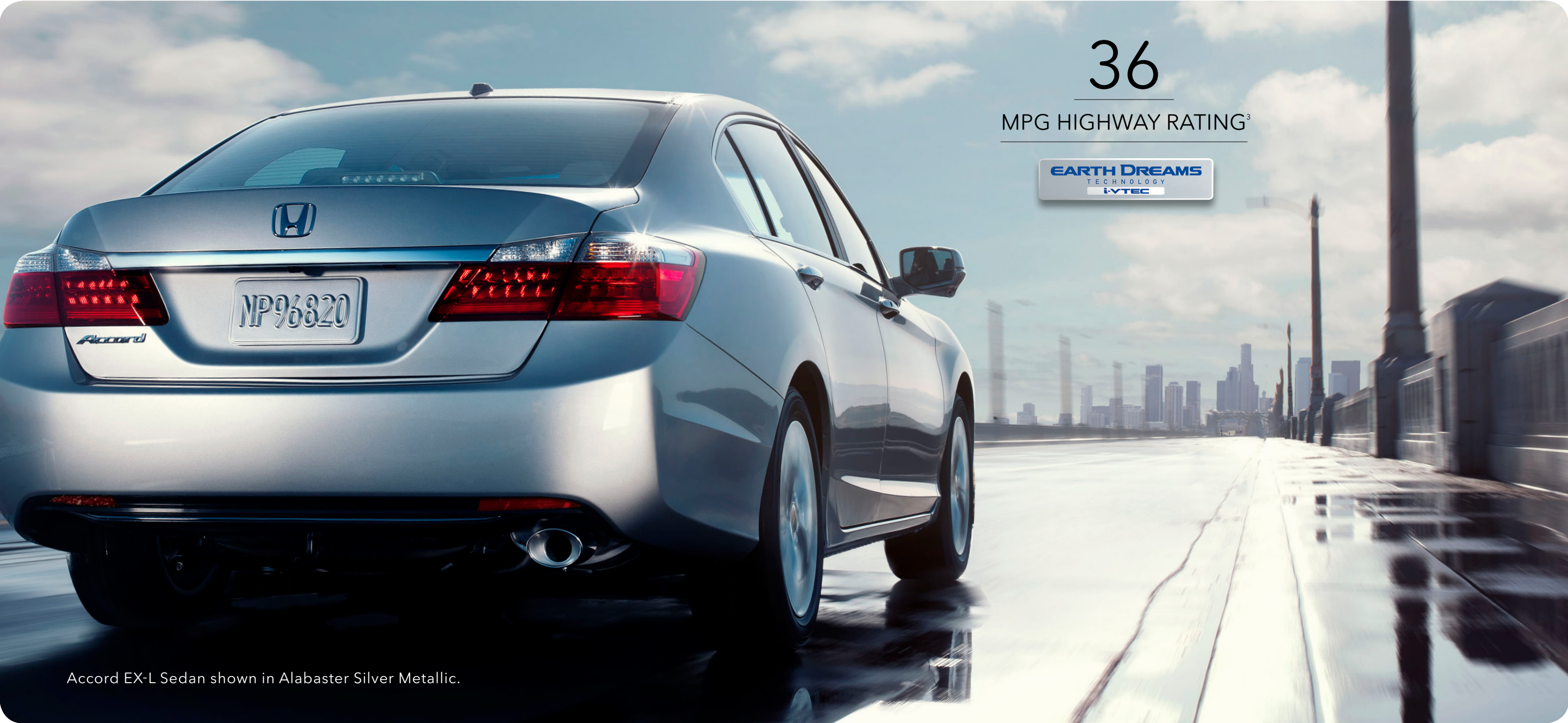
Accord EX-L Sedan shown in Alabaster Silver Metallic.