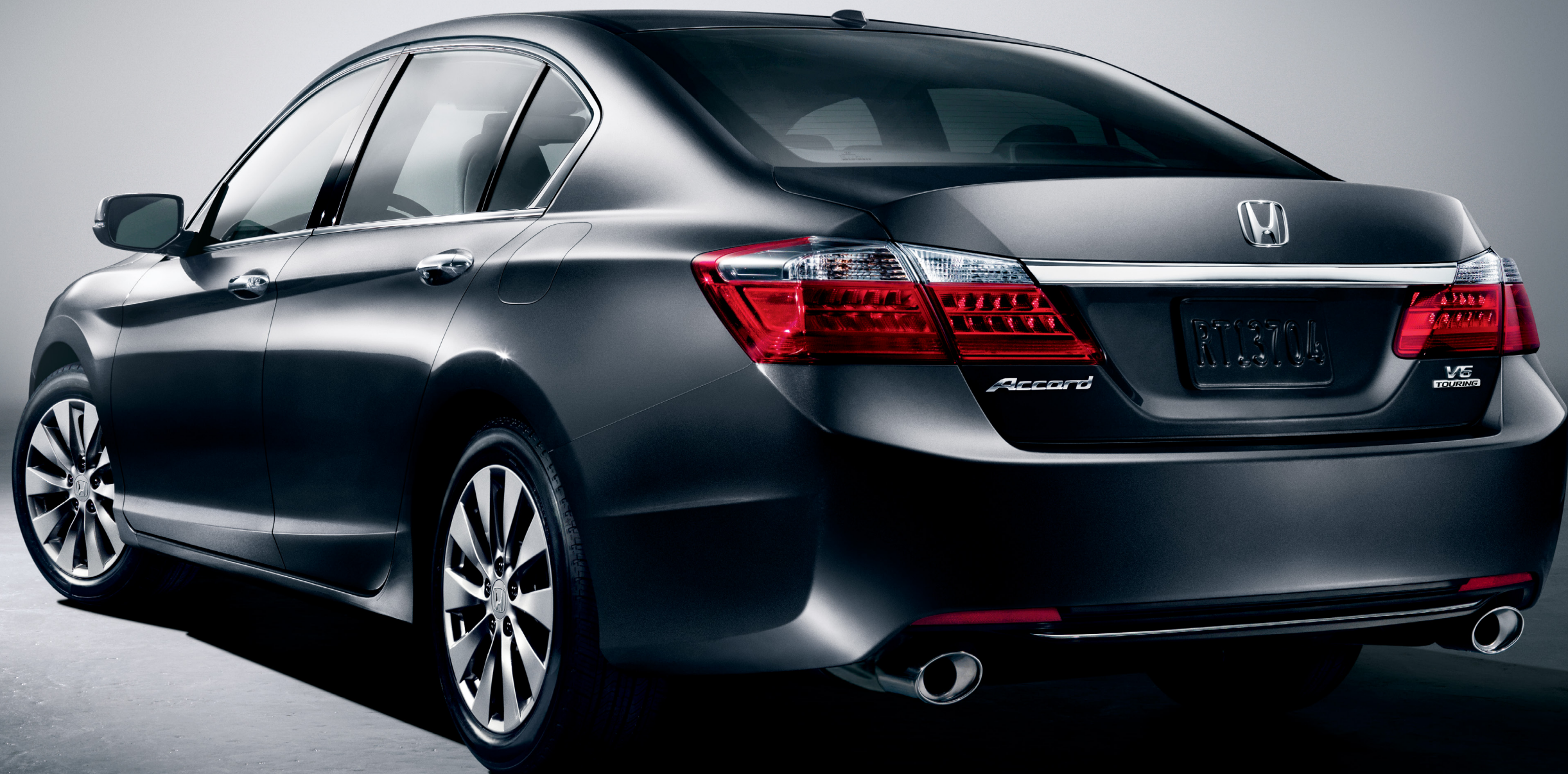
Accord Touring Sedan shown in Modern Steel Metallic.