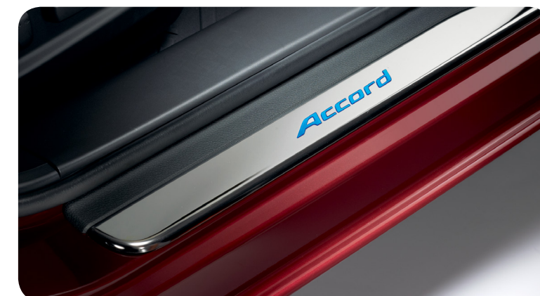
ILLUMINATED DOOR SILL TRIM