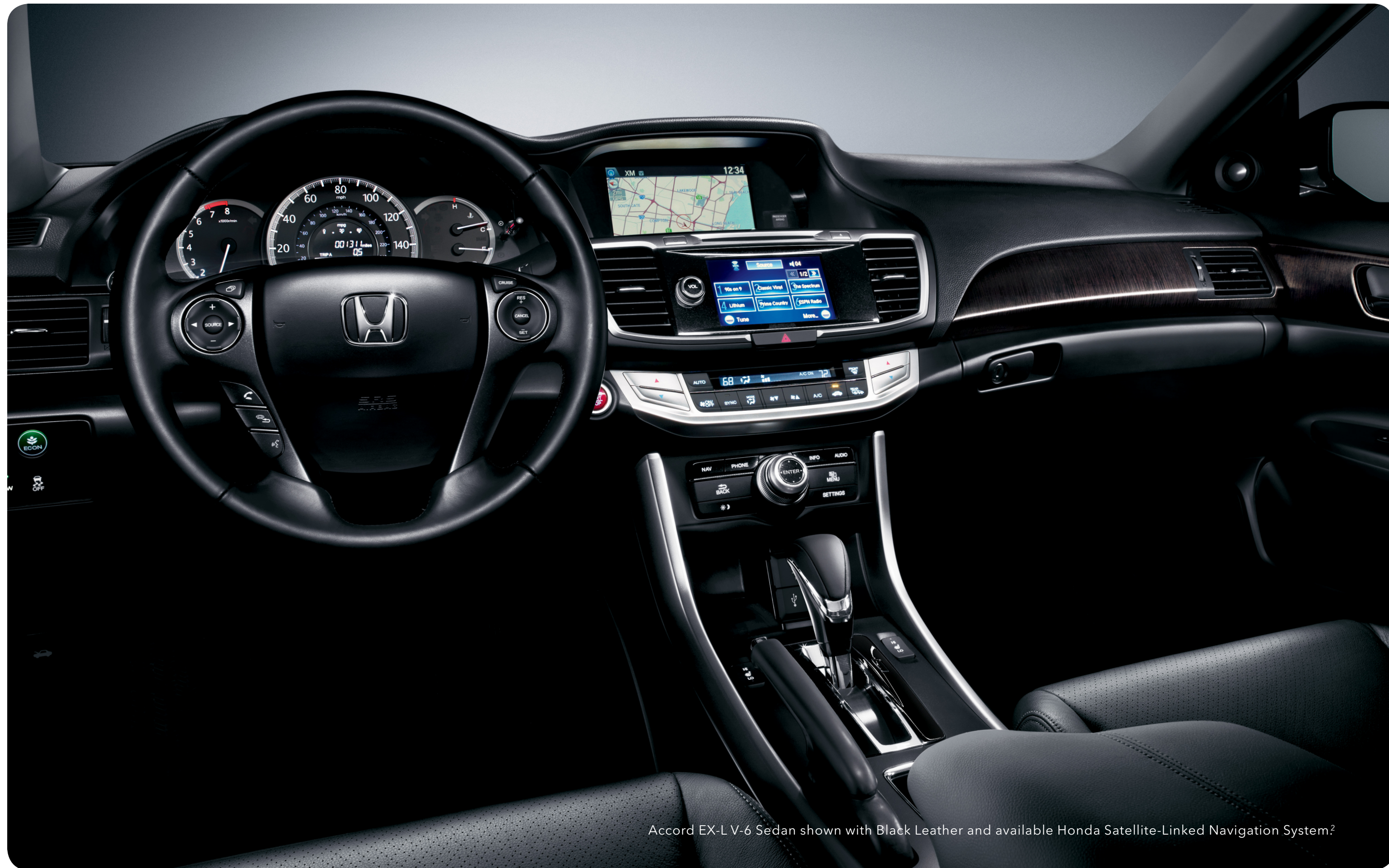
Accord EX-L V-6 Sedan shown with Black Leather and available Honda Satellite-Linked Navigation System. 2