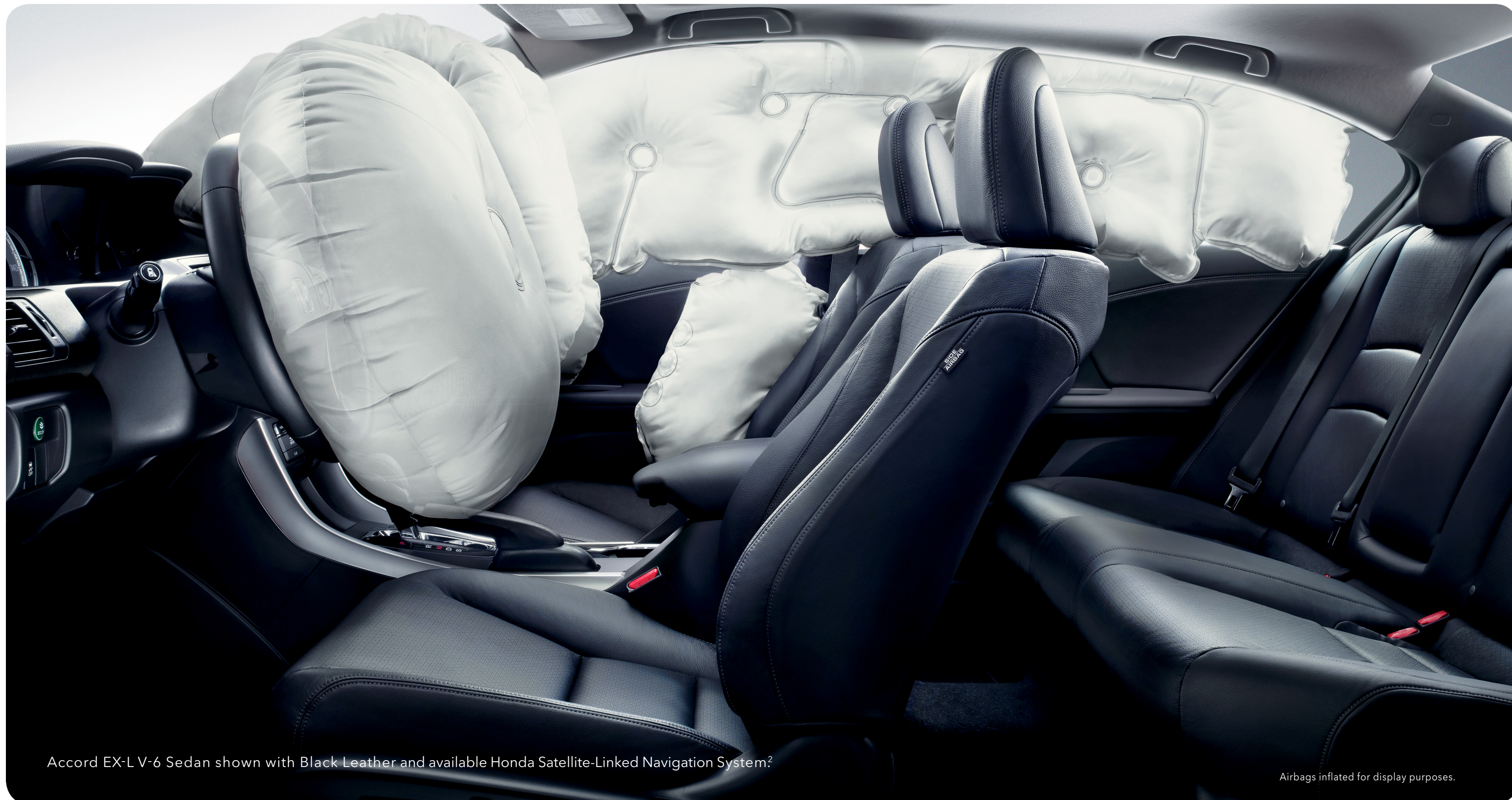
Accord EX-L V-6 Sedan shown with Black Leather and available Honda Satellite-Linked Navigation System. 2