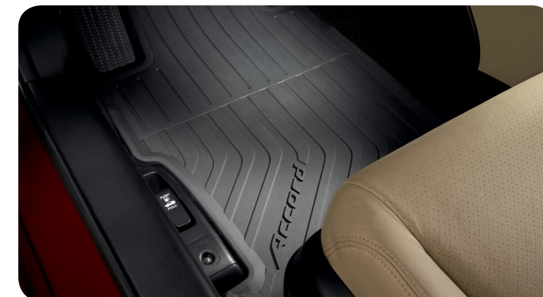
ALL-SEASON FLOOR MATS