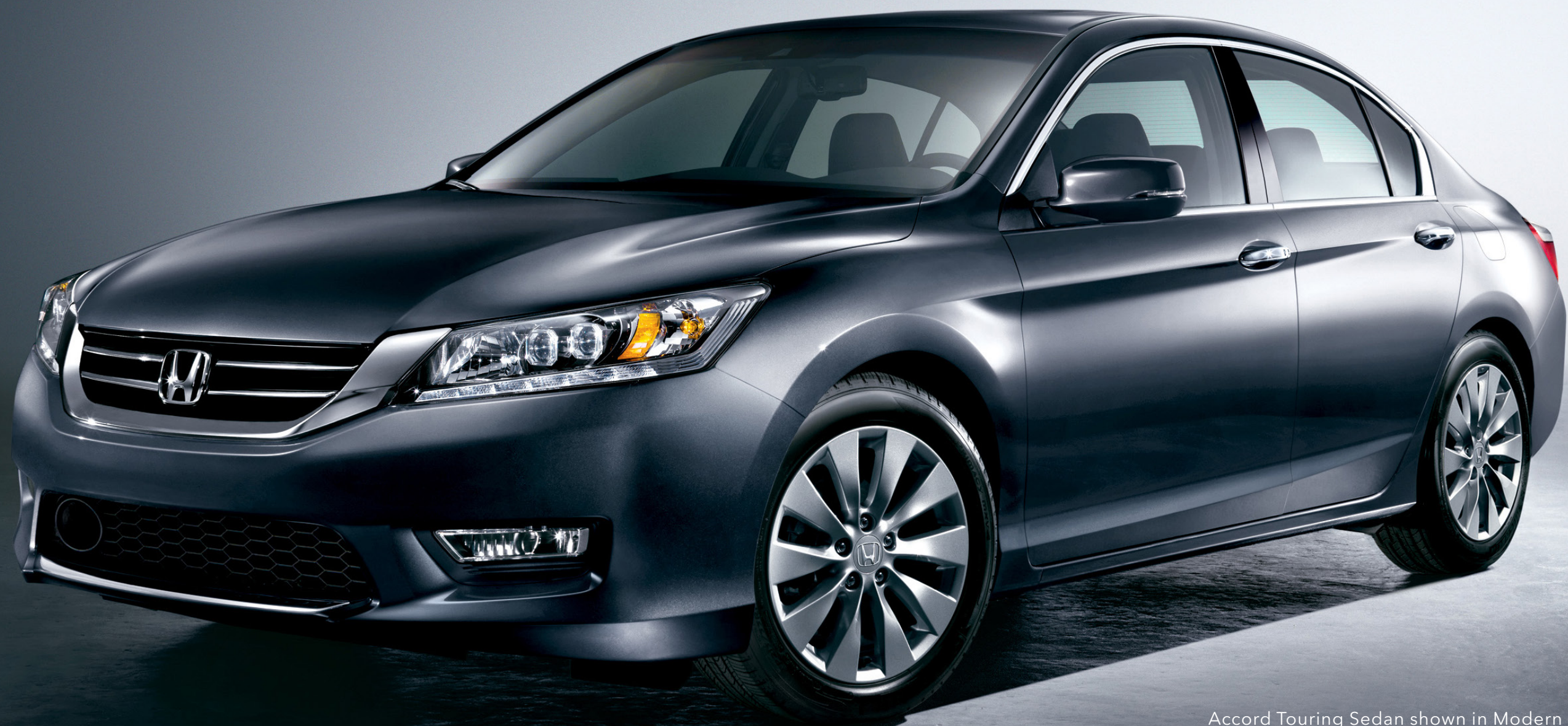
Accord Touring Sedan shown in Modern Steel Metallic.

When does a car become more than just a car? That question has inspired us from the beginning, and for over three decades, the Accord has been our answer. Now in its ninth generation, our signature vehicle continues to evolve with drivers and all of their humanity in mind. And the relationship between an Accord and its owner continues to be something very special.