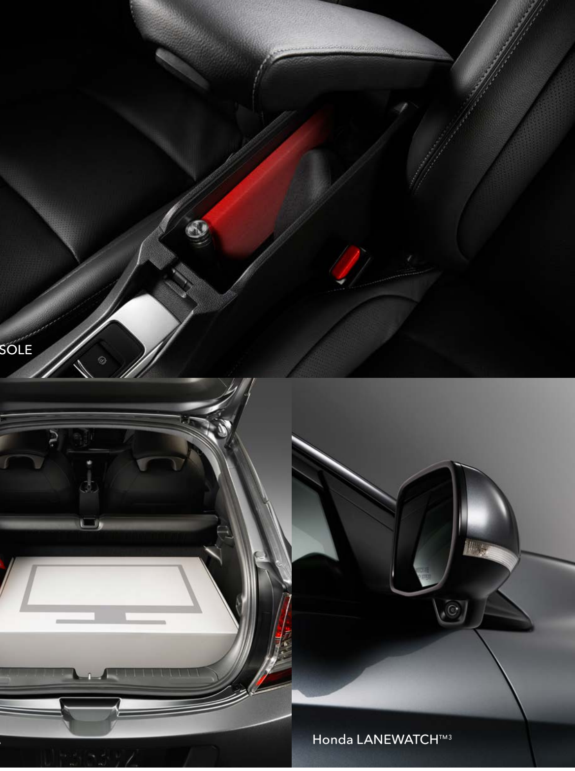
Honda reminds you to properly secure cargo items.

A new center console and armrest provide plenty of space for your stuff, plus a little elbow room.