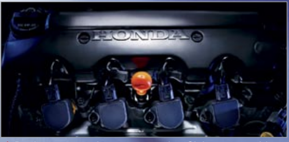
--> Pack some punch, no matter what Civic you go with.

Corner, cruise or pick your way through traffic – it's all handled equally well. The Civic's suspension has been engineered for a solid on-center feel, quick steering and excellent road feel and control.