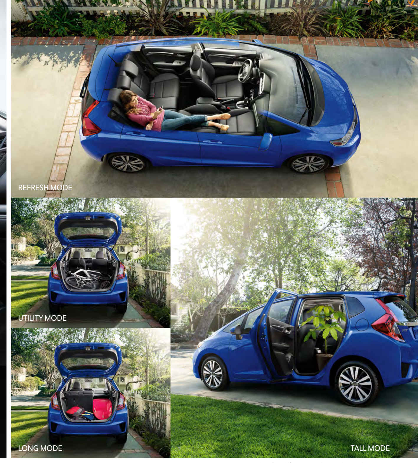
Honda reminds you to properly secure items in the cargo area.