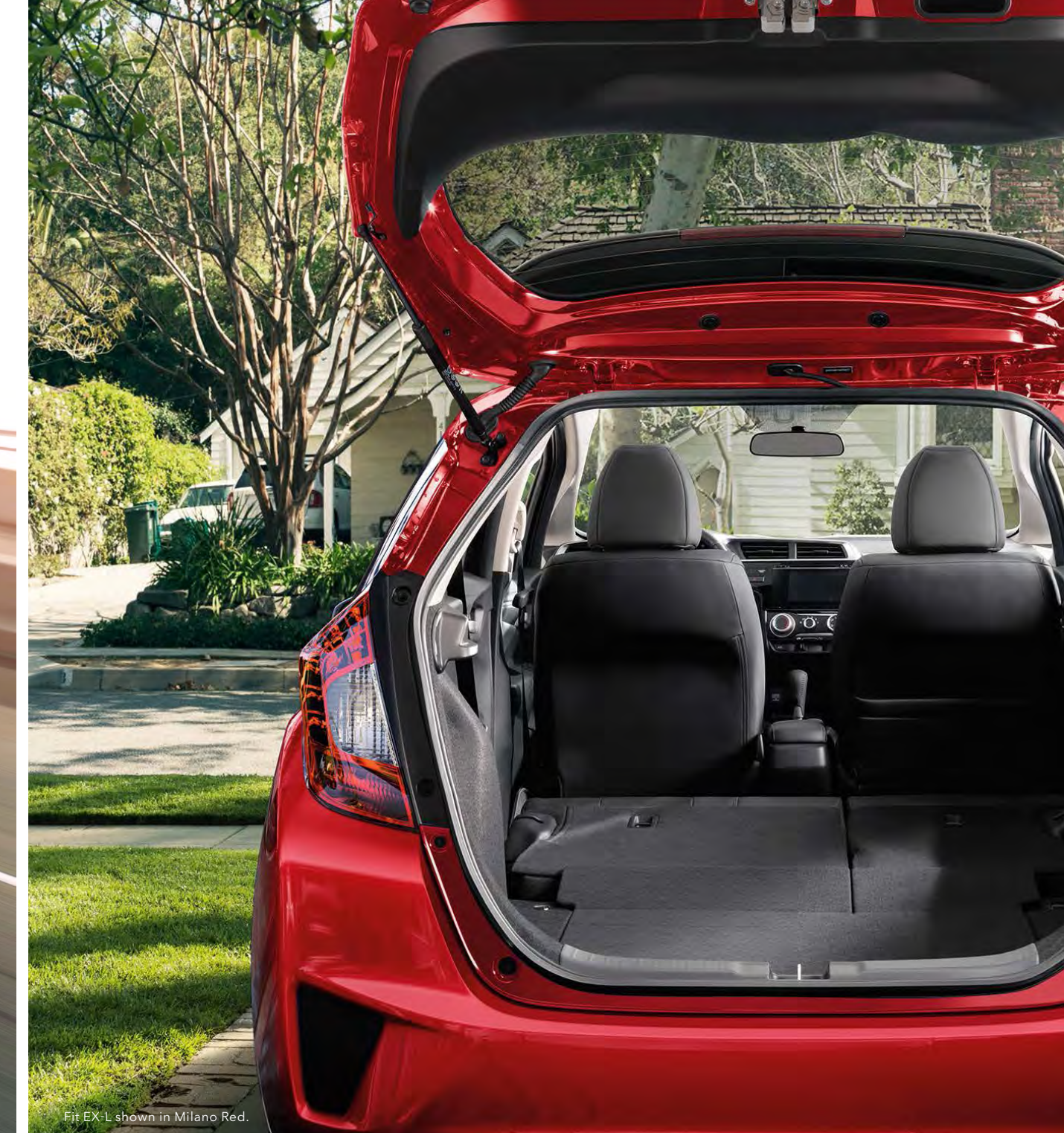
THE 2016 FIT

Small on the outside, roomy on the inside and fierce under the hood. That's the 2016 Fit. It's got space for practically everyone and anything, thanks to four different interior configurations. And it's packed with technology you'll love. See why the Fit is a great fit for you.