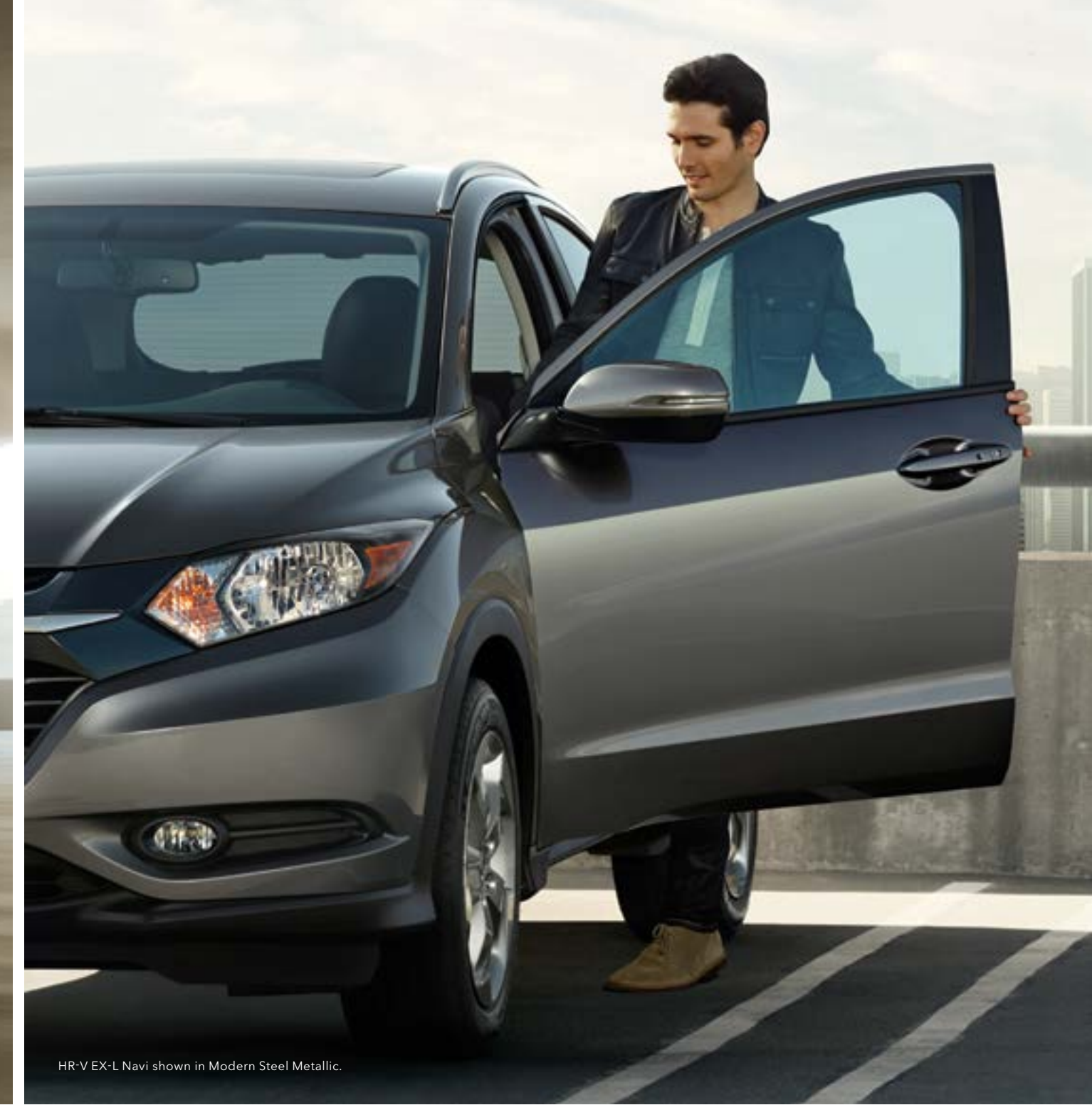
THE ALL-NEW 2016 HR-V CROSSOVER

You are not a category. You don't come with a label. And you don't fit neatly into a box. So why should your car? The all-new Honda HR-V Crossover blurs the line between SUVs, hatchbacks and compacts to create a new kind of vehicle designed to help you forge your own unique path.