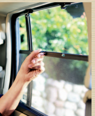
Integrated second-row sunshades are standard on the Touring model.