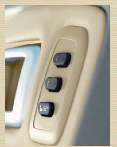
Two-position memory on Touring adjusts driver's seat and outside mirrors.