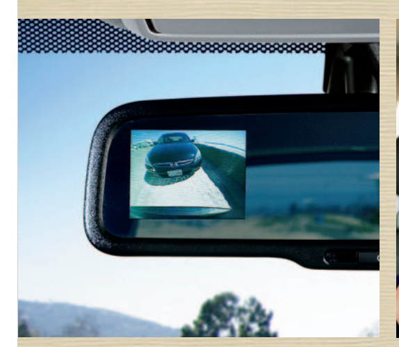
Rearview camera on EX-L models without Navigation utilizes a portion of the rearview mirror as a full-color camera display when you engage reverse. On models with Navigation, the image is displayed on the vehicle's navigation screen.