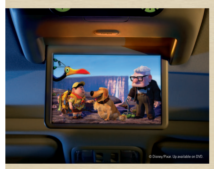
Honda DVD Rear Entertainment System (RES), available on EX-L<sup>3</sup> and standard on Touring, lets rear passengers choose their own distinct audio or video source, or plug in a game console.

†Drive responsibly. Some state laws prohibit the operation of handheld electronic devices while operating a vehicle. For safety reasons, always launch your audio application or perform any other operation on your phone or audio device only when the vehicle is safely parked.