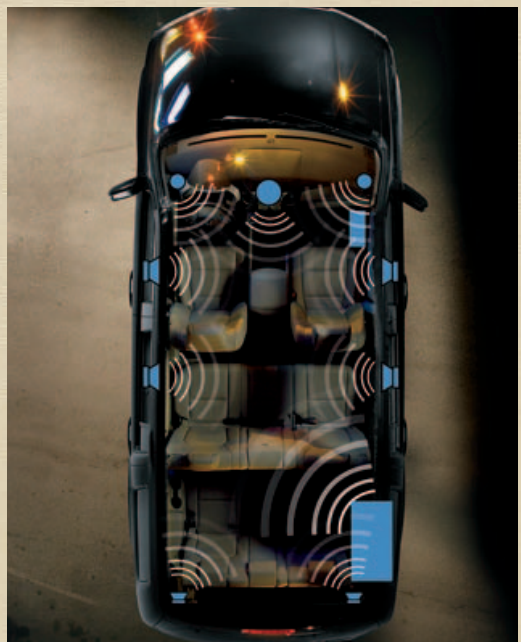
Premium audio system on EX-L with the available RES or Navigation and Touring features 10 speakers, including center channel and subwoofer, surround sound and a 512-watt amplifier. Radio Data System (RDS) on all models can display information on the song currently playing. XM® Radio' is standard on EX and above.