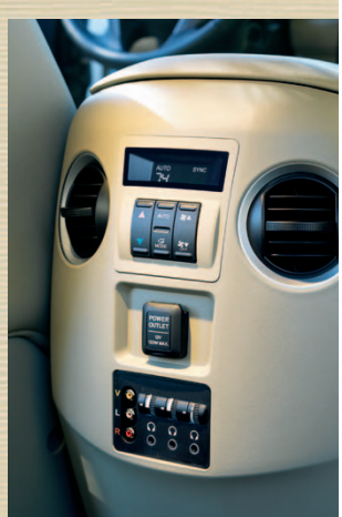
Second row features climate controls and a 12-volt power outlet. Rear entertainment models include RCA inputs for a game console or other video source.

Drive responsibly. Some state laws prohibit the operation of handheld electronic devices while operating a vehicle. For safety reasons, always launch your audio application or perform any other operation on your phone or audio device only when the vehicle is safely parked.