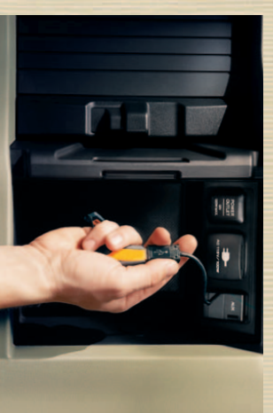
Ports and outlets include a 115-volt outlet and USB Audio Interface<sup>2</sup> on select models.