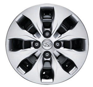
14" Wheel Cover