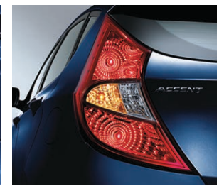
Rear Combination Taillights Hatchback