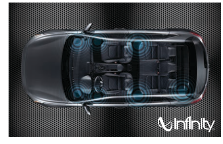
Hear That? Elantra GT's available Infinity® Premium Audio uses Clari-Fi™ Music Restoration Technology to help restore sound quality lost with digitally compressed music. Even the most discerning audiophile will be impressed by the deep bass, clear mid-range and crisp highs. It's like you're listening to a live performance.