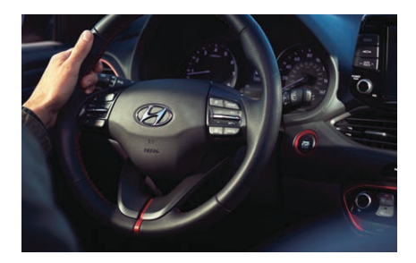
Play A New Sport Inside of your Elantra GT Sport, reminders that you're in a hot hatch are everywhere. There's the standard leather seating surfaces with more aggressive bolsters and contrast stitching, the steering wheel paddle shifters at your fingertips, alloy pedals at your feet and sport-inspired accents throughout the interior.

Wrap your hands around the thick rim of the multi-function 3-point tilt-and-telescopic steering wheel. Set the dual automatic temperature control to the preferred individual setting for you and your front passenger. Now relax and enjoy the deep comfort of the seat beneath you. Those heated leather seats are also available with cooling ventilation. After all, you're the precious cargo, right?