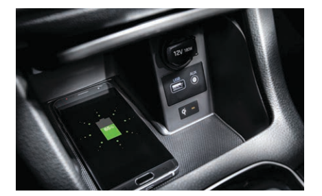
Cut The Cord You knew there had to be a better way to keep your smartphone charged, right? Well, here it is: Just set your compatible smartphone down on Elantra GT's available Qi wireless charging pad, and its battery will soak up all the power it needs.