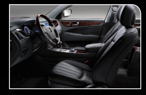
JET BLACK LEATHER / GENUINE WALNUT WOOD