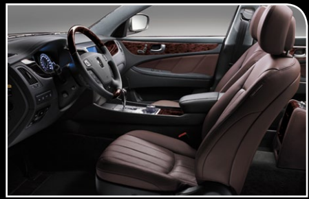
SADDLE BROWN LEATHER / GENUINE WALNUT WOOD