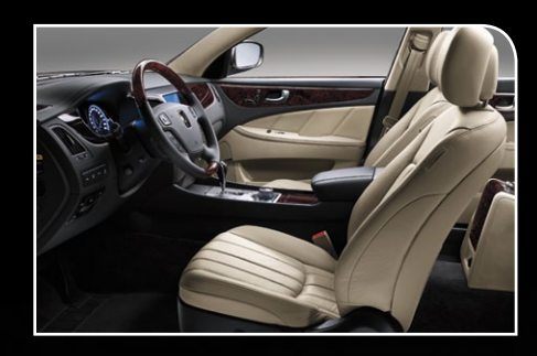
CASHMERE BEIGE LEATHER / GENUINE BIRCH BURL WOOD