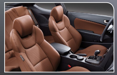
3.8 GRAND TOURING TAN LEATHER