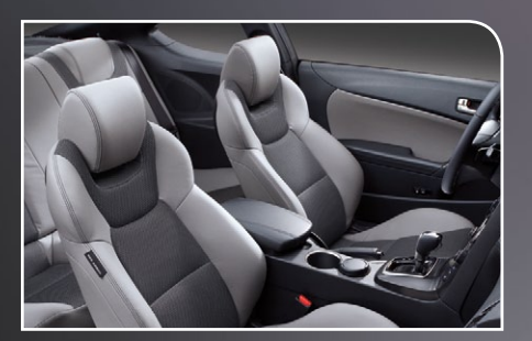
2.0T PREMIUM GREY LEATHER BOLSTER / GREY CLOTH INSERT