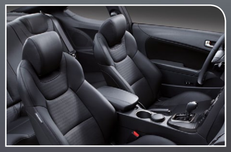
3.8 GRAND TOURING / 3.8 TRACK BLACK LEATHER