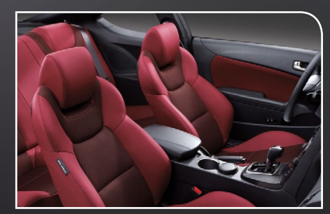
2.0T & 3.8 R-SPEC RED LEATHER BOLSTER / RED CLOTH INSERT