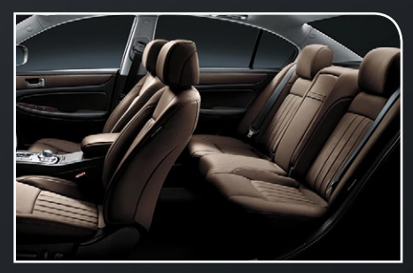
SADDLE LEATHER / ZEBRA WOOD