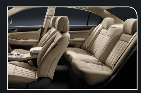
CASHMERE LEATHER / RED EUCALYPTUS WOOD