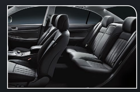
JET BLACK LEATHER / BLACK MAPLE WOOD