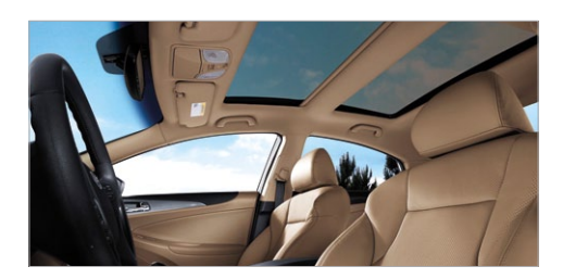
IN A CLASS BY ITSELF

How confident can you be in our lithium polymer battery technology? It comes with a lifetime warranty – an industry first.* It also fits in the trunk, giving Sonata Hybrid the largest passenger volume among midsize hybrid sedans. A regenerative braking system even recharges the car's batteries on the road. For more information on the new thinking behind Sonata Hybrid, visit your nearest Hyundai dealer or find us online at hyundaiusa.com.