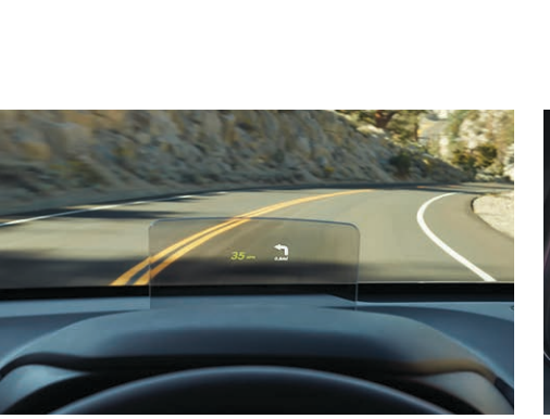
Full-color Heads-up Display