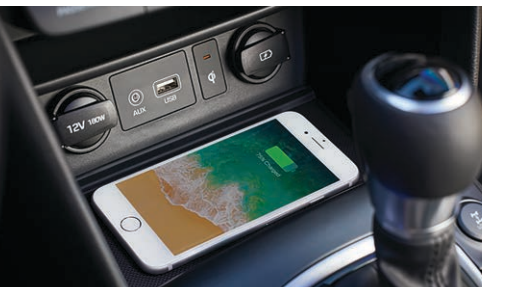
Wireless device charging