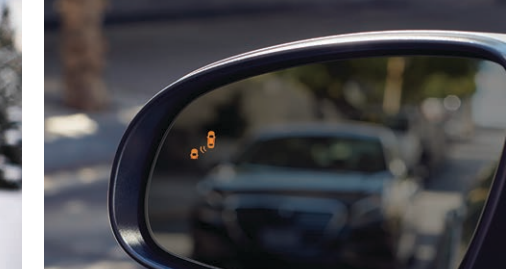
Forward Collision-Avoidance Assist Blind-Spot Collision Warning