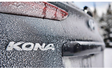
Rear View Monitor with Parking Guidance All Wheel Drive