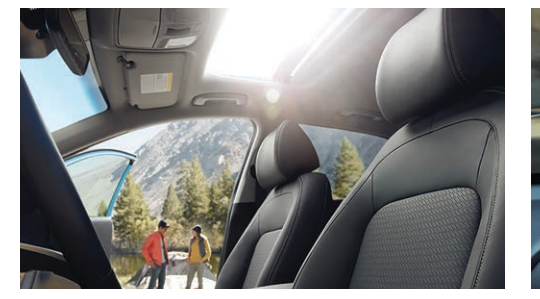
Power tilt-and-slide sunroof