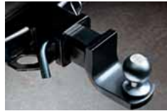
A CONVENIENT TOW HITCH IS READY TO HAUL YOUR TOYS TO YOUR FAVORITE DESTINATIONS.