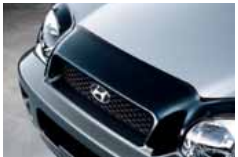
A DEALER-INSTALLED HOOD DEFLECTOR PROTECTS THE FINISH AGAINST DIRT, DEBRIS AND CHIPS.