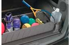
A FOLDING CARGO ORGANIZER CONVENIENTLY KEEPS YOUR STORAGE SPACE TIDY.

If you'd like to customize your Santa Fe, please see your Hyundai dealer for the full line of Hyundai accessories. You should always use genuine Hyundai parts and accessories, which meet strict standards for quality and durability.