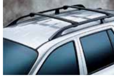
ROOF CROSS RAILS THAT ACCOMMODATE SKI, SNOWBOARD AND BIKE CARRIERS.