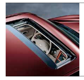
LET THE OUTSIDE IN REGARDLESS OF THE WEATHER. CHOOSE A POWER TILT-AND-SLIDE MOONROOF WITH SUNSHADE.

here are times when things are not what they seem. In this case, however, what you see is what you get, and then some. The Sonata has an air of sophistication but, the sleek lines of this elegant sedan were not created purely for the sake of design. In fact, the Sonata's good looks are as functional as they are fashionable; every aspect of it is dedicated to offering a rewarding ownership experience. The handsome grille and aerodynamic, projector-type halogen headlights direct airflow around the interior. Stylish 16" aluminum alloy wheels and substantial 205/60HR16 Michelin® tires provide a smooth ride. While some cars are all about appearances, the Sonata is one sedan that drives as well as it looks.