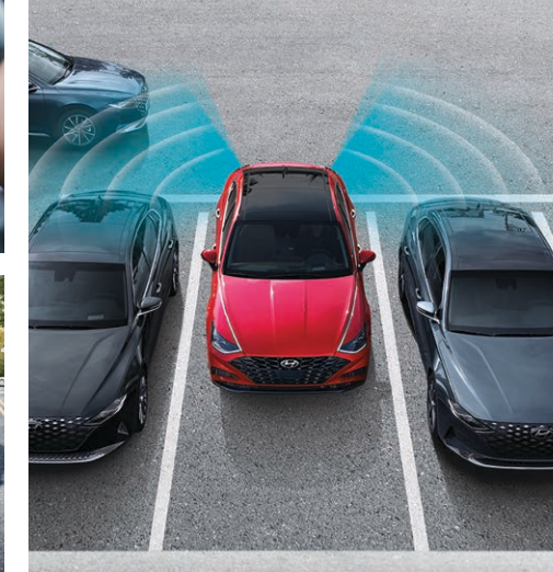
Rear Cross-Traffic Collision-Avoidance Assist