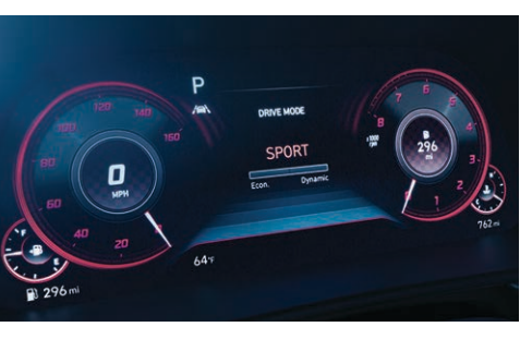
12.3" instrument cluster display in Sport Mode