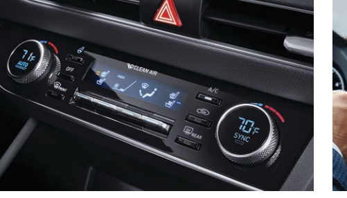
Dual automatic temperature controls