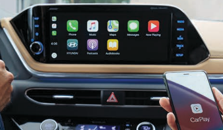
10.25" touchscreen display with Apple CarPlay

SONATA Limited in Dark Gray / Camel Leather