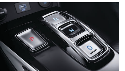
Electronic push-button gear selection