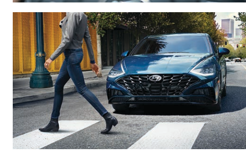
Blind-Spot View Monitor Forward Collision-Avoidance Assist with Pedestrian Detection