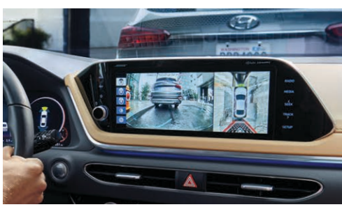
Surround View Monitor