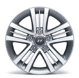
16-INCH GS ALLOY WHEEL