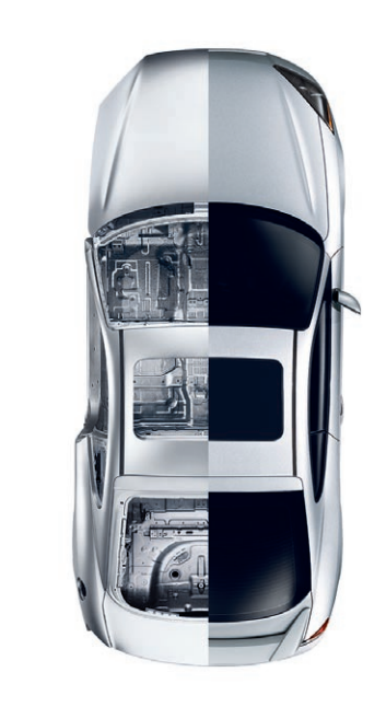
BOTH SIDES AGREE For left-brain thinkers and right-brain dreamers. The 2008 Hyundai Tiburon.

We also believe in a warranty that lasts twice as long as the average car loan. Not to mention the average car warranty.