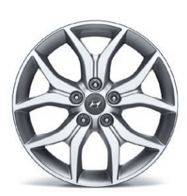
17-INCH GT/SE ALLOY WHEEL