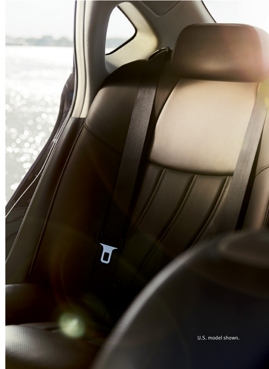
U.S. model shown.