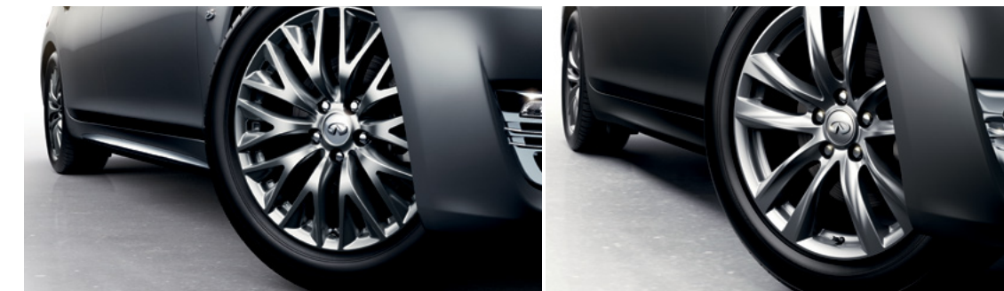
18 X 8.0-INCH ALUMINUM-ALLOY WHEELS