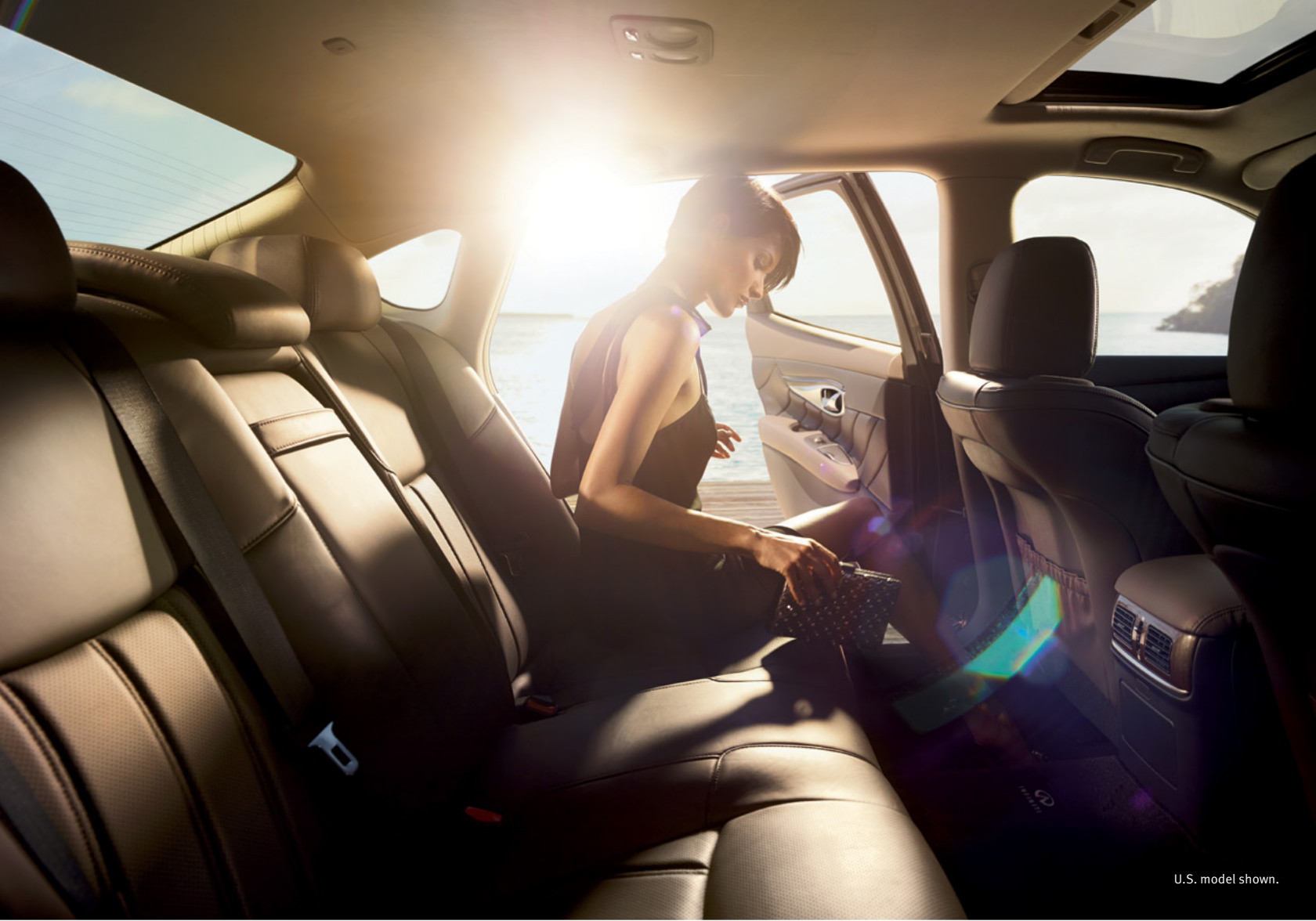
U.S. model shown.