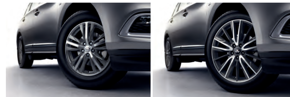
18 X 7.5-INCH TRIPLE 5-SPOKE ALUMINUM-ALLOY WHEELS