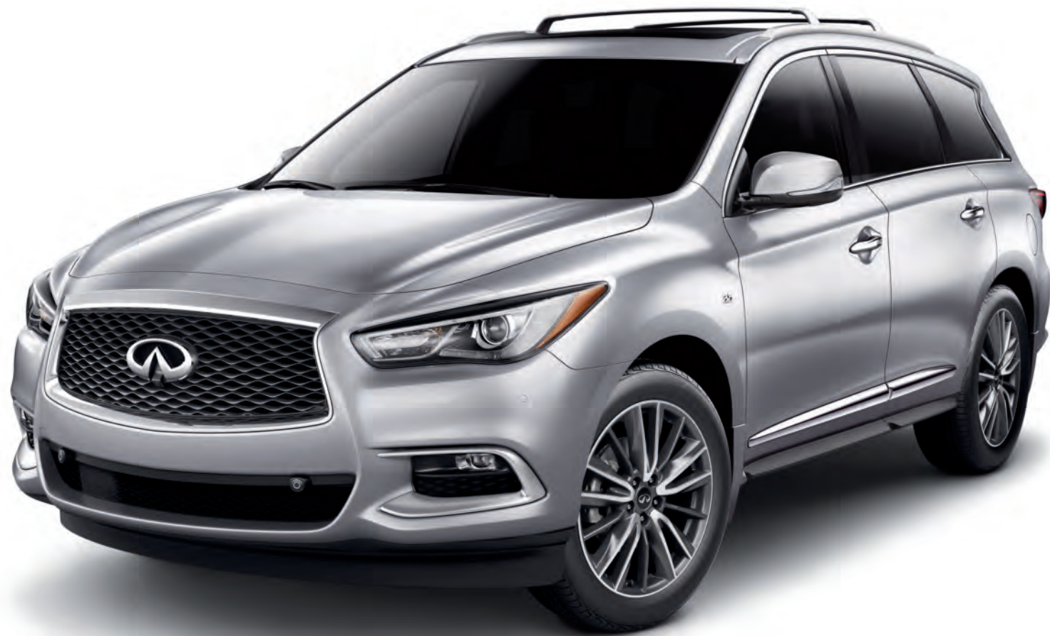
ACCESSORIES SHOWN Roof rail crossbars 3 and splash guards.

The same exacting standards applied to the creation of an Infiniti vehicle go into designing and manufacturing Genuine Infiniti Accessories. With a wide array of quality products designed to integrate seamlessly, you can be assured of a custom fit and finish. 20 For more information and to shop online for Genuine Infiniti Accessories, go to parts.InfinitiUSA.com .