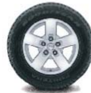
17-inch Wrench Cast Aluminum with machined face and Sparkle Silver accents — Standard