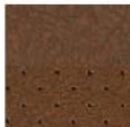
Yuma Leather with perforated Inserts Saddle Brown — Standard