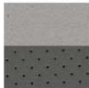
Yuma Leather with perforated Inserts Two-tone Light Graystone/ Dark Khaki — Standard