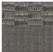
Telluride Cloth/Albi Cloth Medium Khaki — Standard