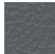
McKinley Leather Trim Medium Slate Gray — Available