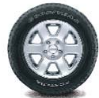
17-inch Chrome-Clad Forged Aluminum — Available on Commander Limited