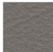
McKinley Leather Trim Medium Khaki — Available