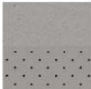
Yuma Leather with perforated Inserts Light Graystone — Standard