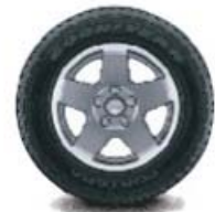
17-inch Hulk Cast Aluminum painted Mineral Gray — Available on Commander

For more information, please visit jeep.com/commander