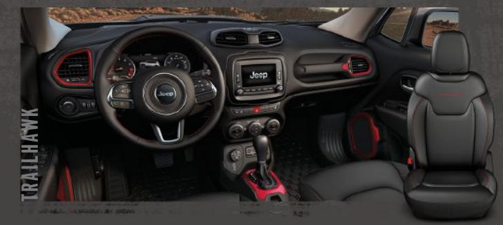
BLACK LEATHER TRIM WITH RUBY RED ACCENT STITCHING AND EMBROIDERED LOGO PLUS ANODIZED RUBY RED BEZEL ACCENTS – OPTIONAL ON TRAILHAWK