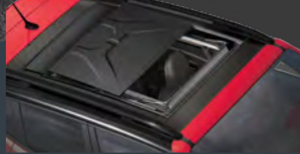
The My Sky® power retraction operates like a traditional sunroof, allowing fore and aft ventilation with the front panel. Press the button for quick and easy rooftop ventilation.

This available sunroof with its power sunshade offers more than an amazing way to look at the world. It can take you to a new world altogether. Two large panes allow passengers in all rows to get a stellar panoramic view of the scenery. With the push of a button, the front pane slides back to let in the fresh air of the outdoors. Add more to every adventure when you can see more and feel more open-air freedom.