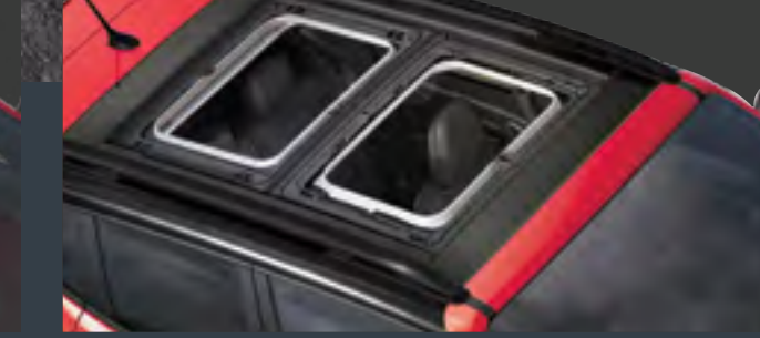
The My Sky lets you manually remove<sup>14</sup> both the front and rear panels for a full open-air experience.